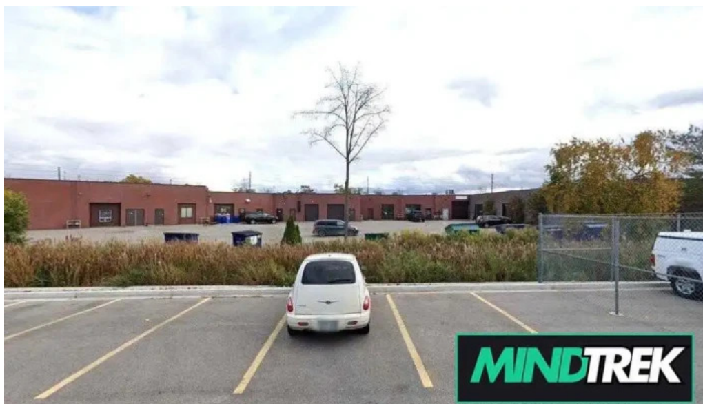
Nalu vit pitcher psychotherapist barrie