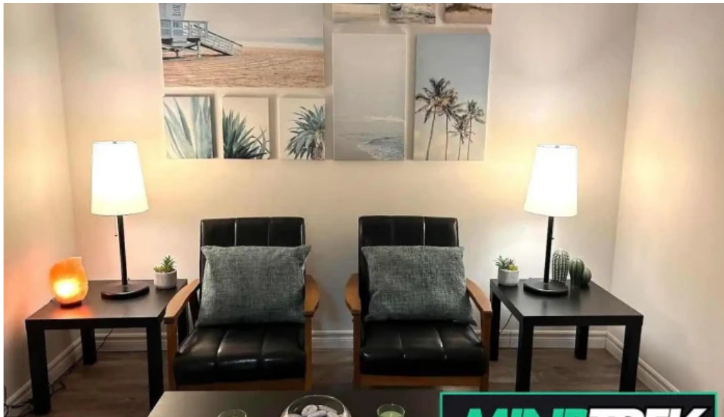
Livewell psychotherapy barrie