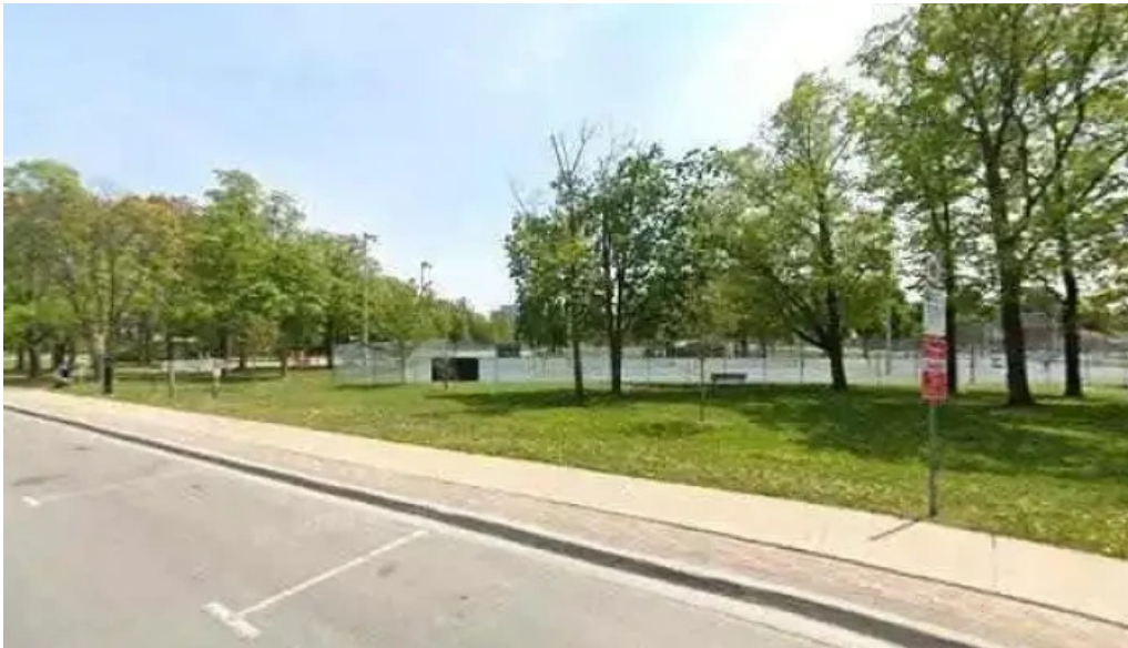
Livewell psychotherapy street view 360deg