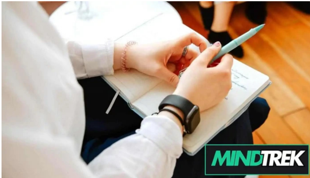
Compassionate choice psychotherapy and counselling by owner