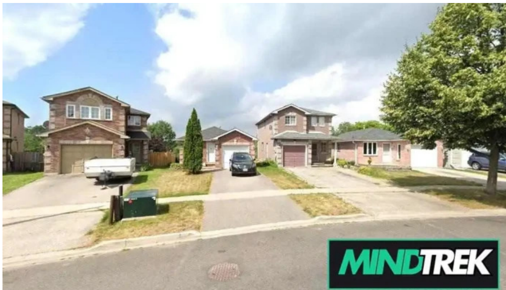
Compassionate choice psychotherapy and counselling barrie