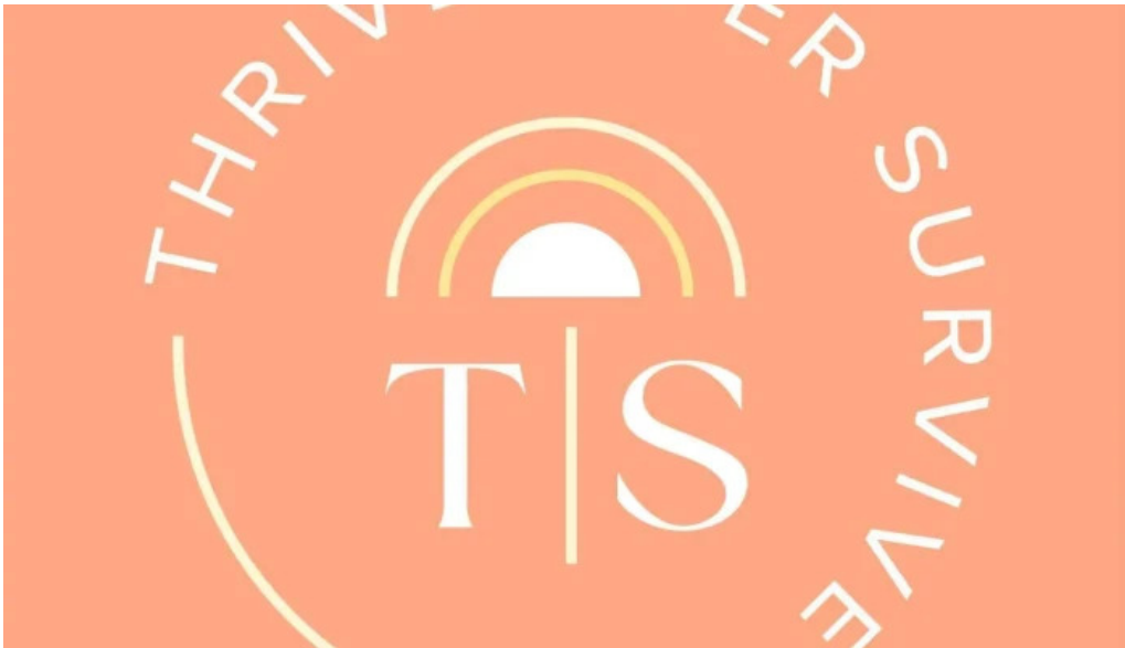
Thrive over survive by owner