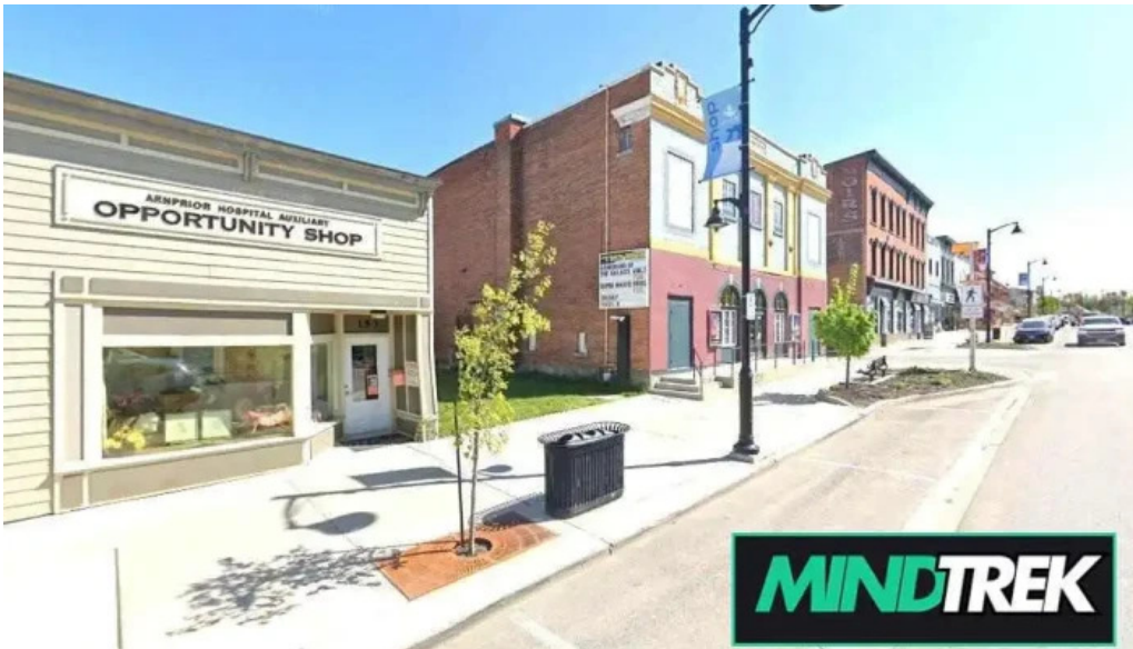
Thrive over survive arnprior