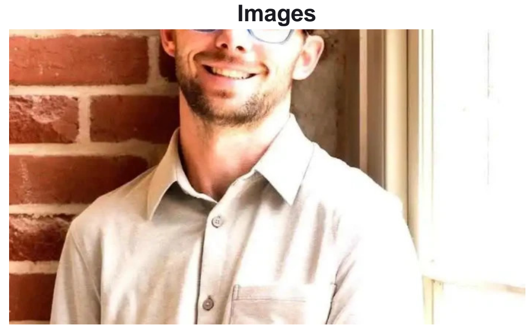
Milestone wellness amherstview

If necessary to change any element that you feel is not correct related to this page, please forward a message and we will fix it at the earliest convenience. Thanks beforehand thank you very much.