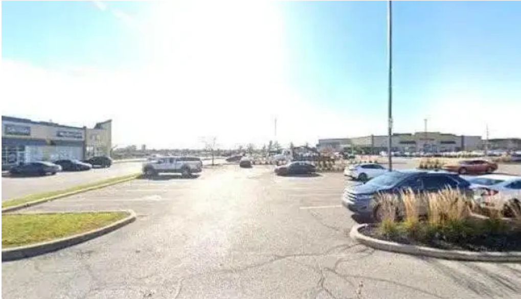
Mindful healing journey street view 360deg