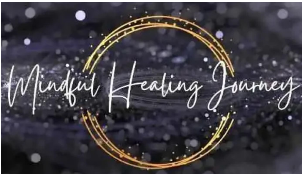
Mindful healing journey ajax