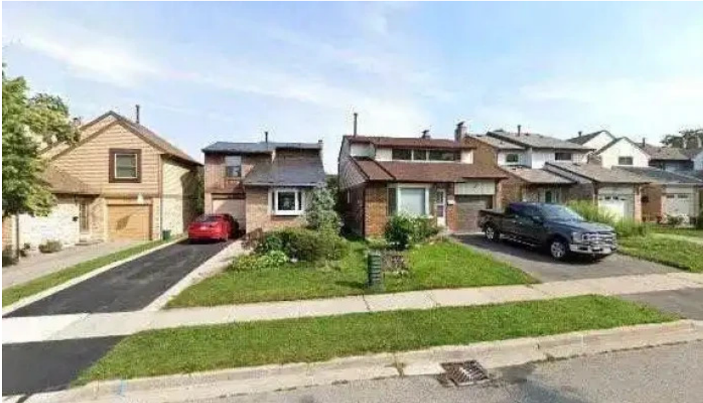
Liminal counselling all