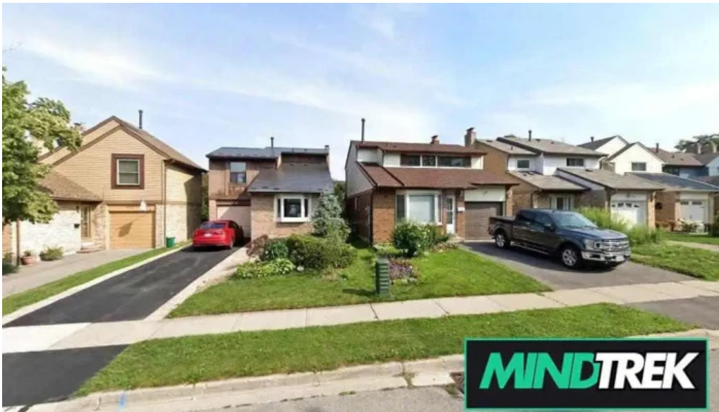
Liminal counselling ajax