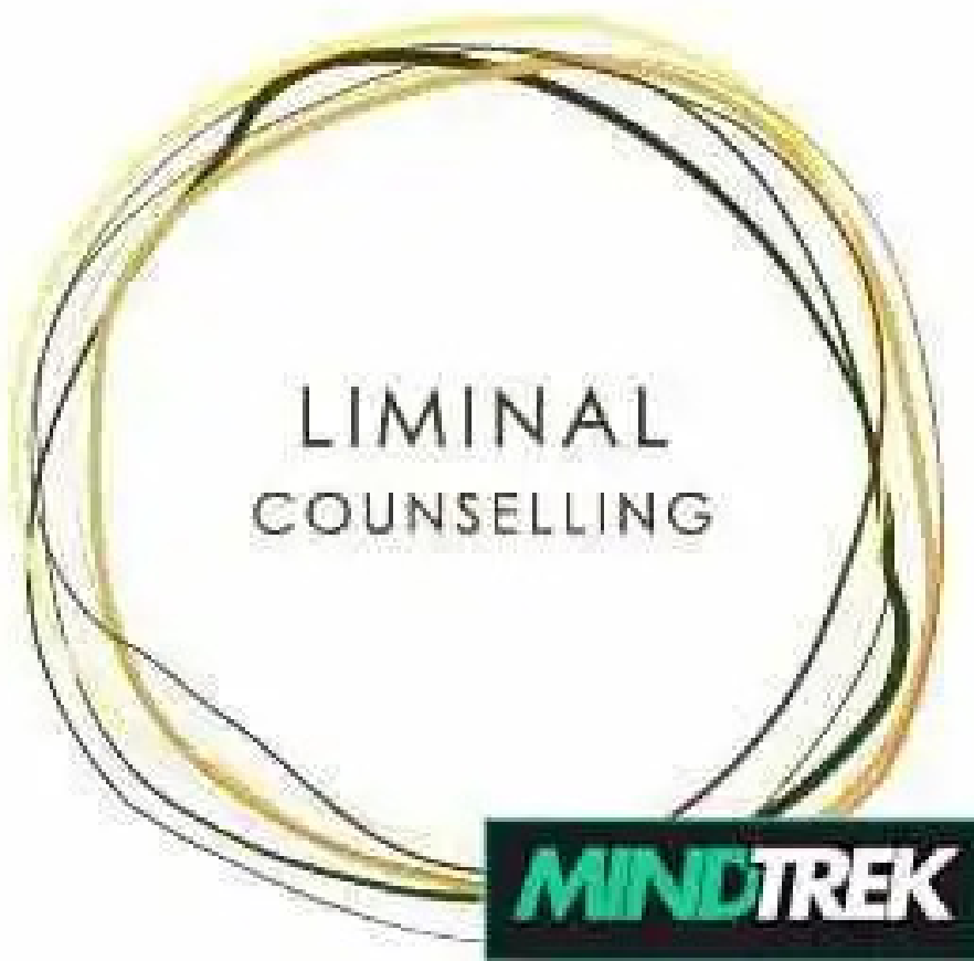
Liminal counselling by owner