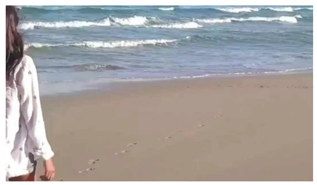
Acquah counseling and consulting services videos