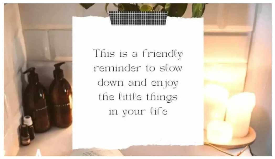
Acquah counseling and consulting services ajax