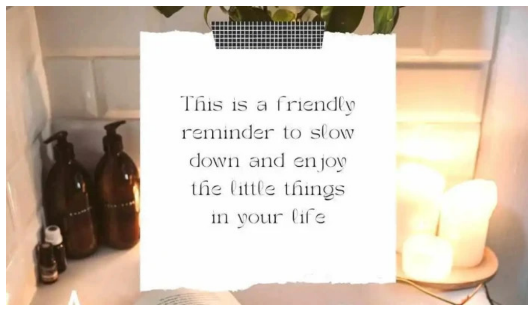
Acquah counseling and consulting services all