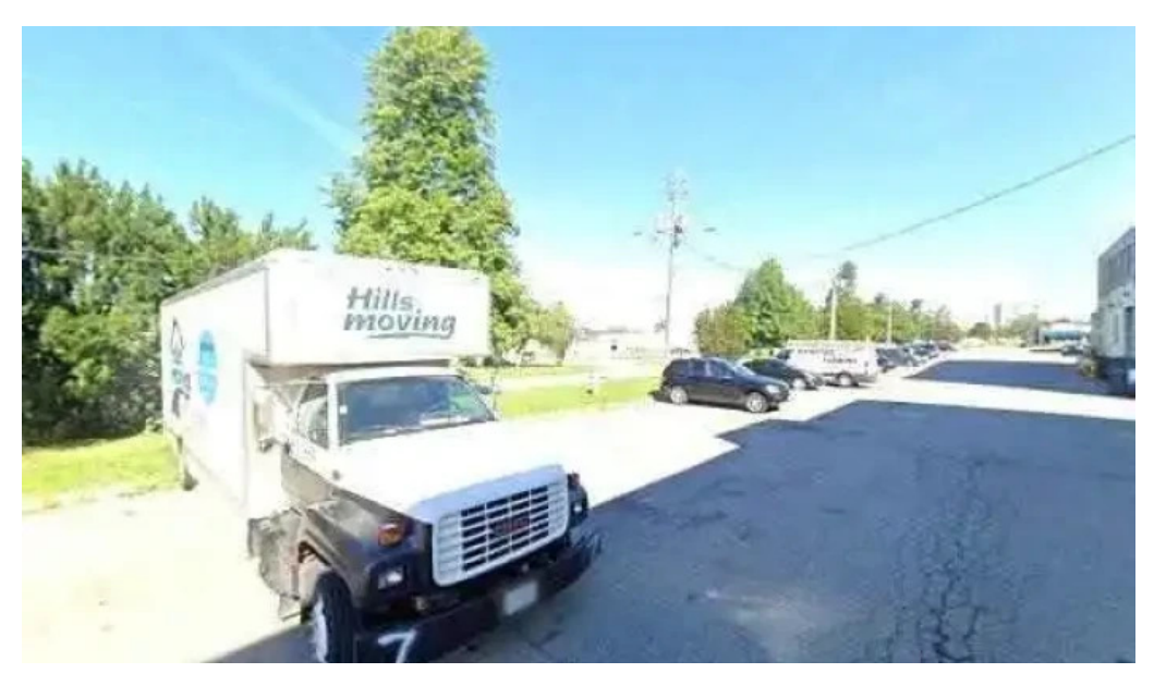
Acquah counseling and consulting services street view 360deg