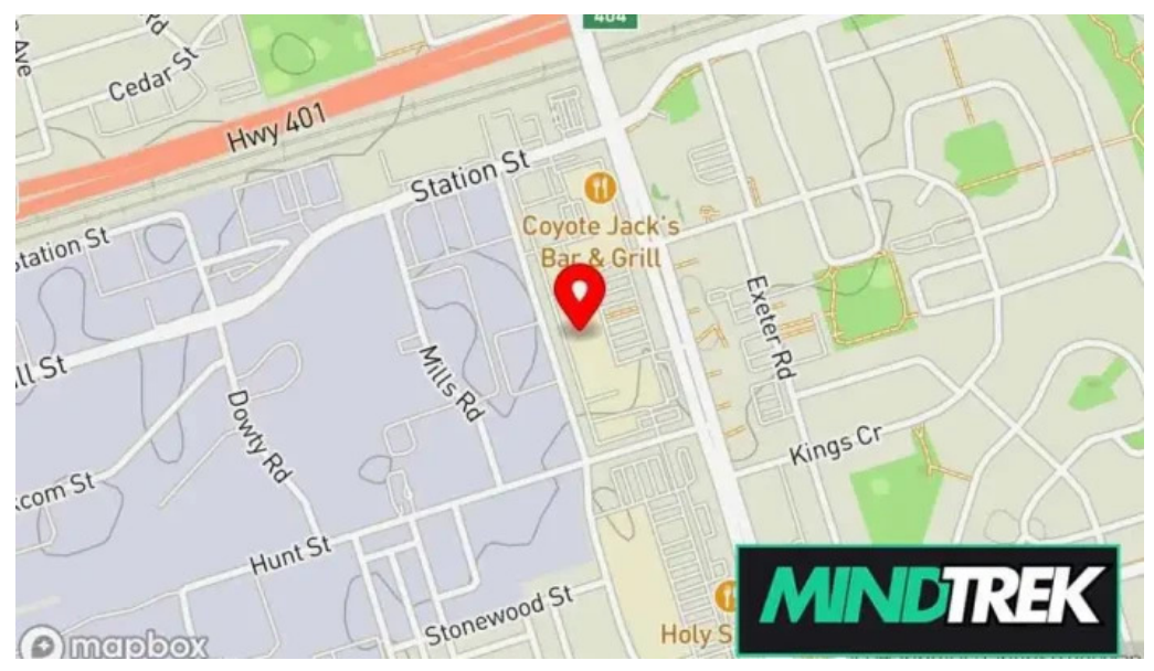
Acquah counseling and consulting services map