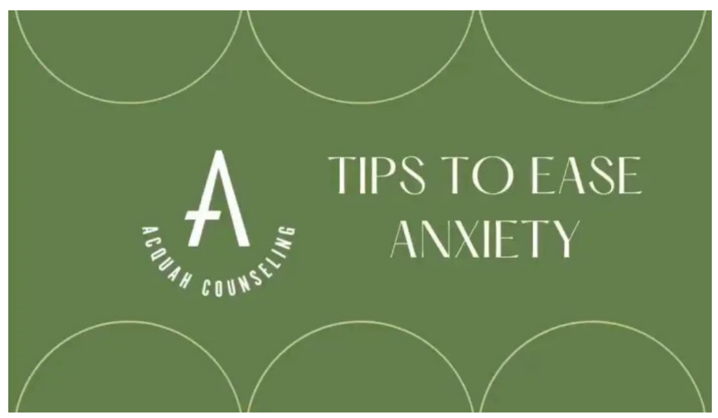
Acquah counseling and consulting services by owner