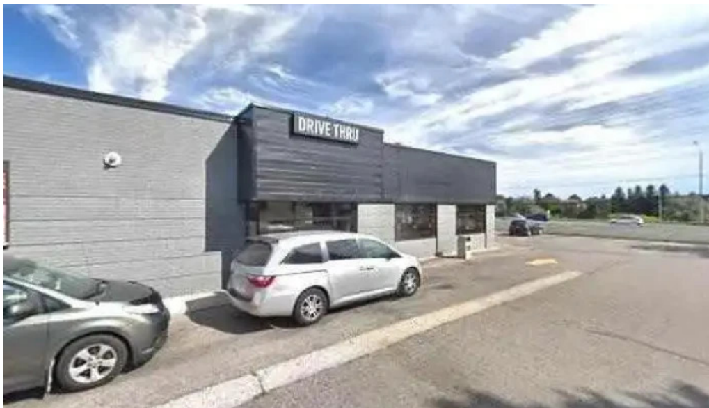
Narrative therapy centre all