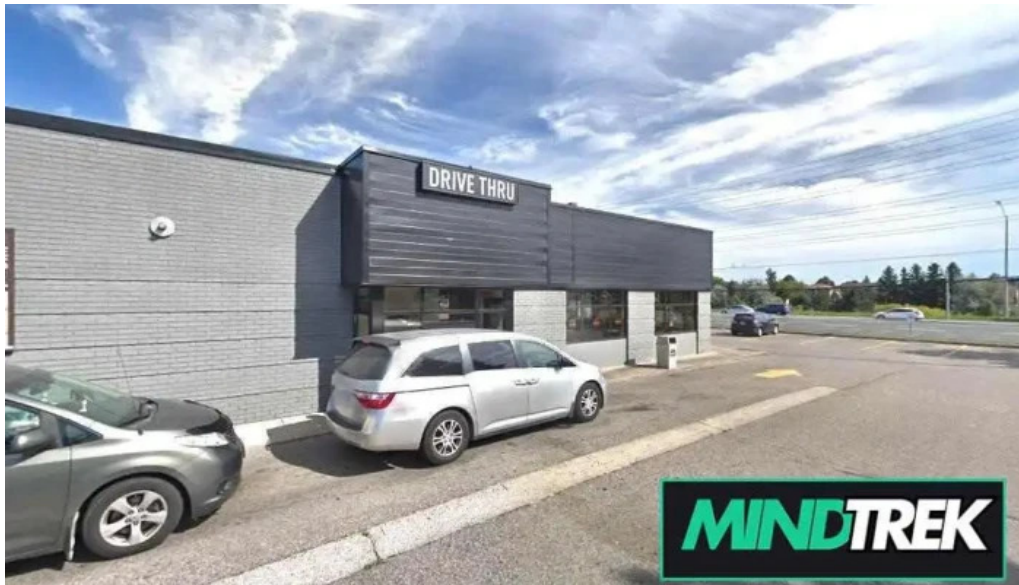
Narrative therapy centre ajax