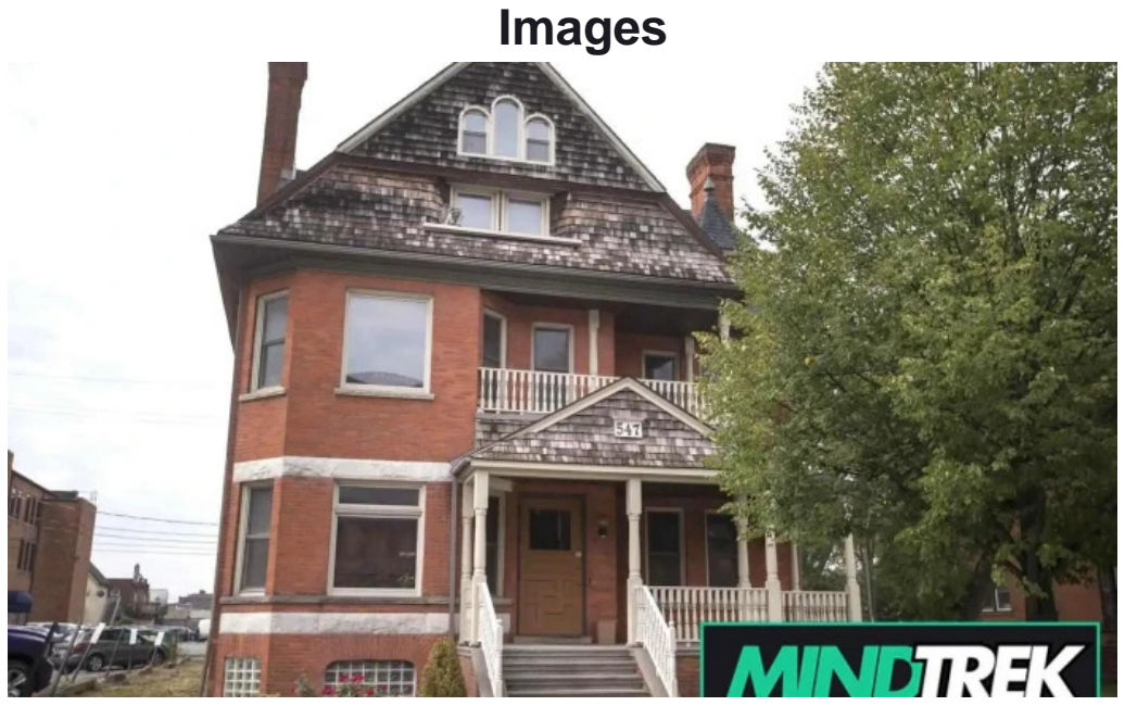
Paragon psychological services windsor

If you wish to change any information that you feel is incorrect related to this web, please deliver a message so we can we will handle it promptly. Thanks beforehand thanks for your cooperation.