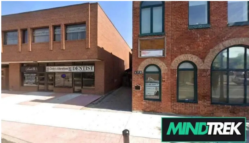
Psychology for growth whitby