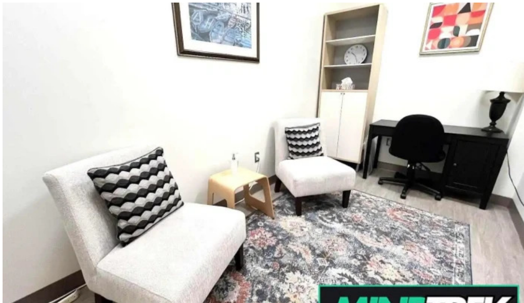
Psychological counselling services group whitby