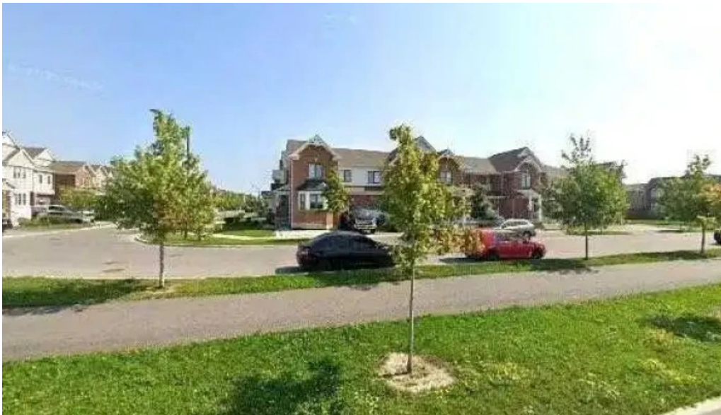
Psychological counselling services group street view 360deg