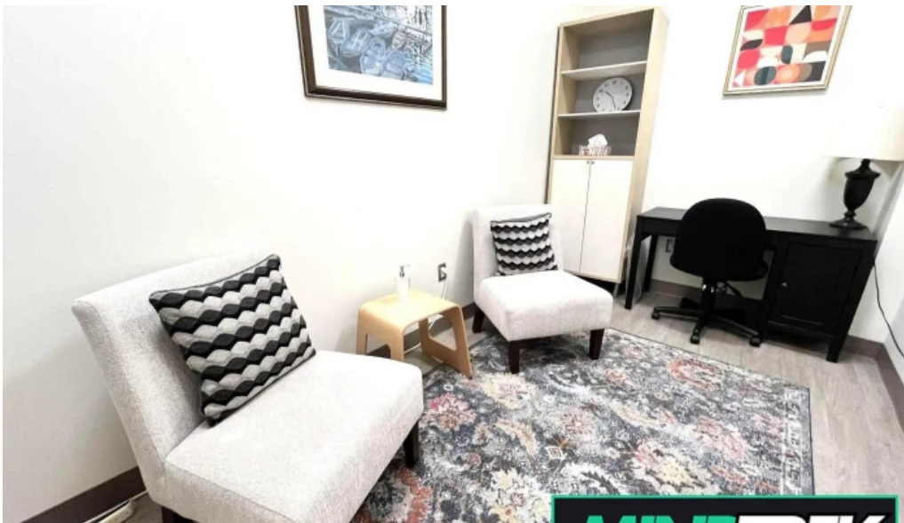
Psychological counselling services group all