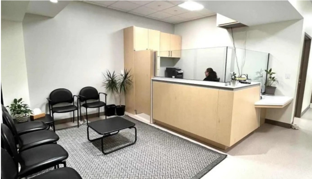
Psychological counselling services group by owner