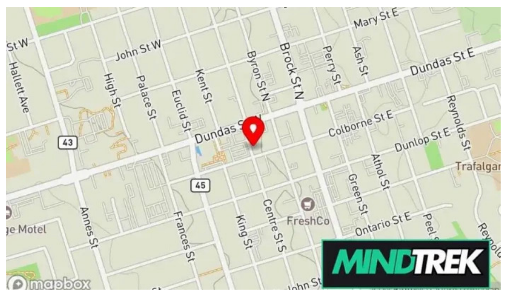
Durham psychology wellness centre map