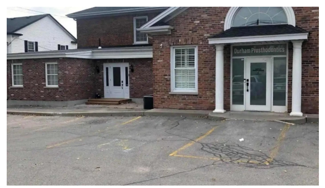
Durham psychology wellness centre by owner