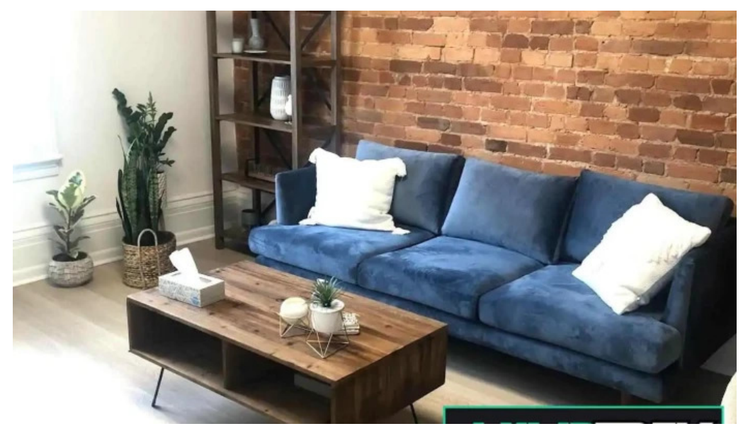
Durham psychology wellness centre whitby