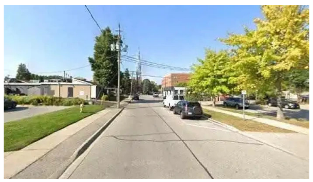
Durham psychology wellness centre street view 360deg