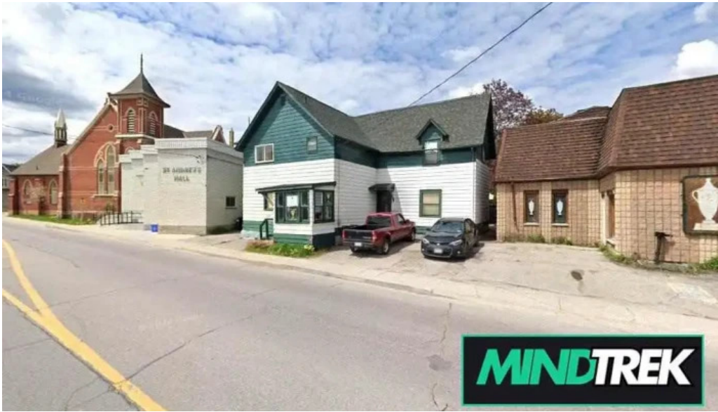
Psychology wellness uxbridge

forward a message and we will handle it at the earliest convenience. Thanks beforehand thank you very much.