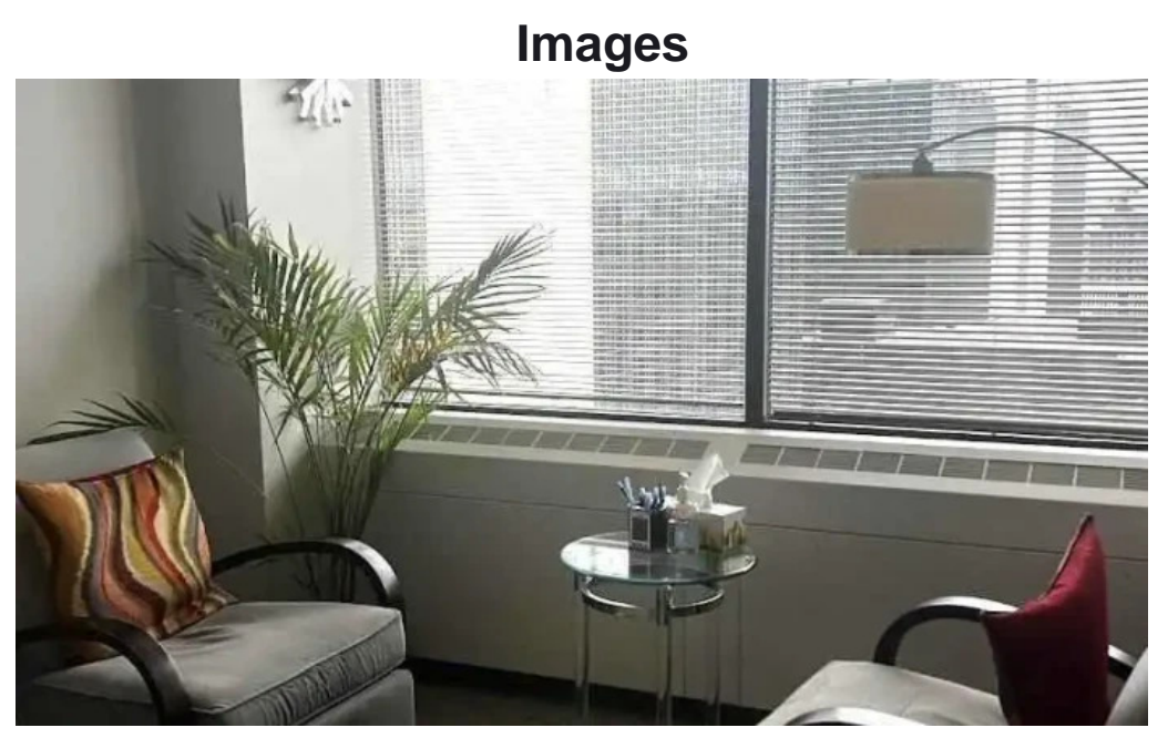
Cognitive interpersonal therapy centre toronto

In case you want to modify any data that you feel is not precise regarding this web, we ask send a message so that we will fix it promptly. Thanks beforehand thanks.