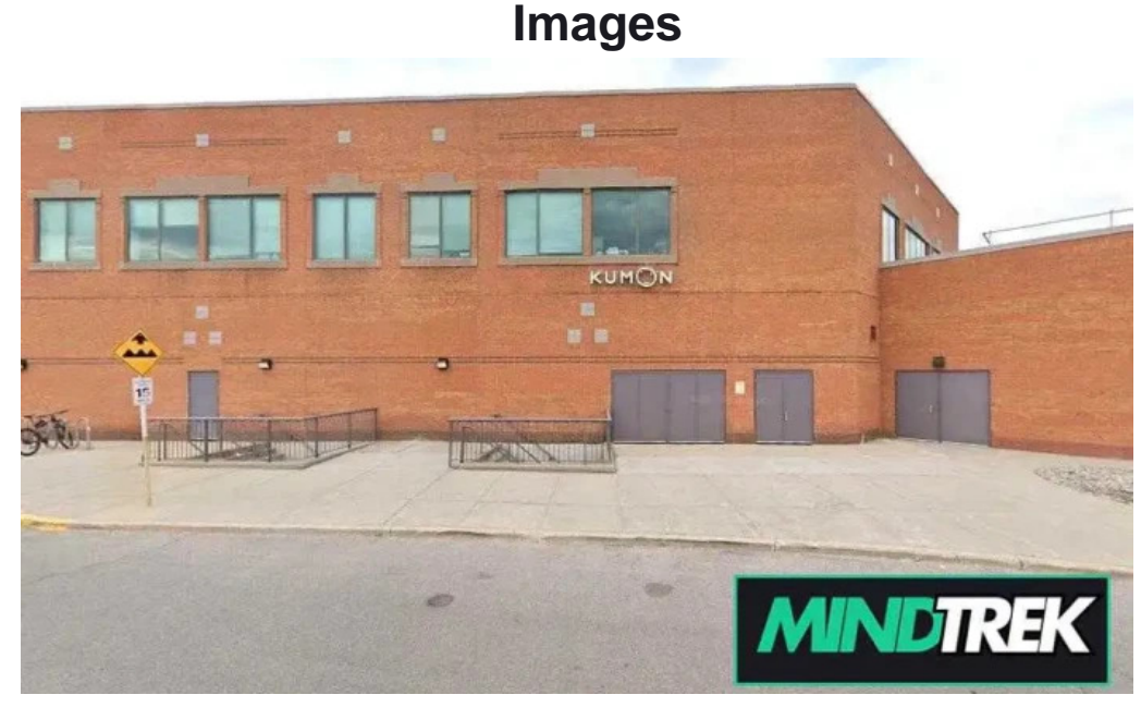
Alter stuckler associates thornhill

If you wish to modify any element that you think is incorrect related to this portal, we ask forward a message so we can we will adjust it as soon as possible. With anticipation thank you very much.