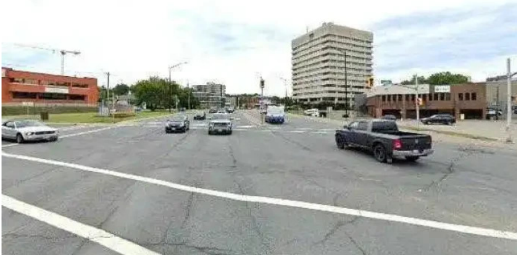
Blackwell psychological svc all