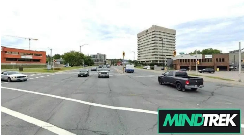
Blackwell psychological svc sudbury