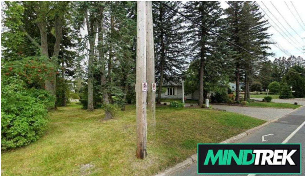
Revive psychological services sault ste marie