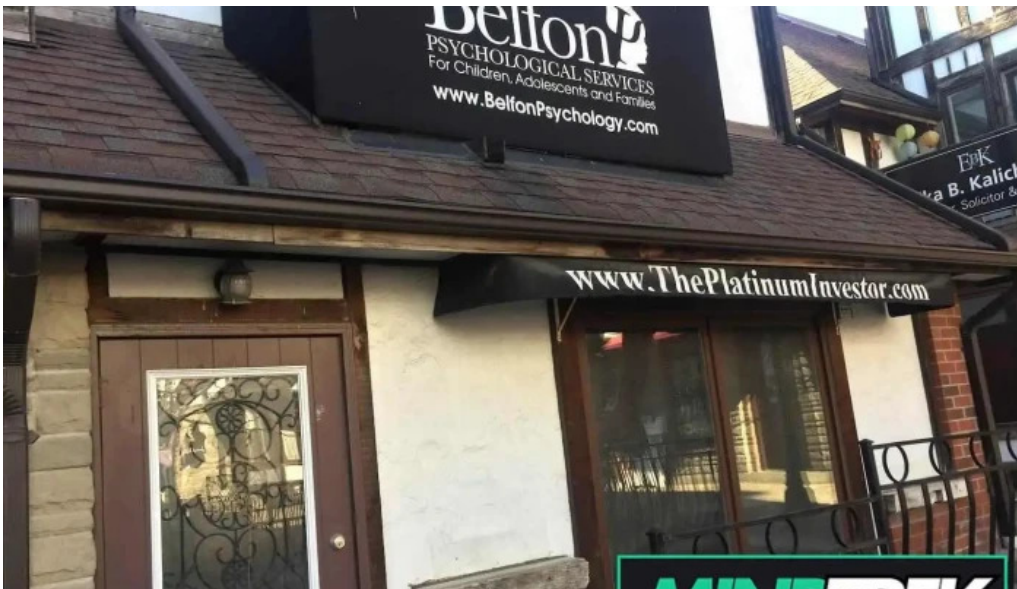
Belfon psychology pickering