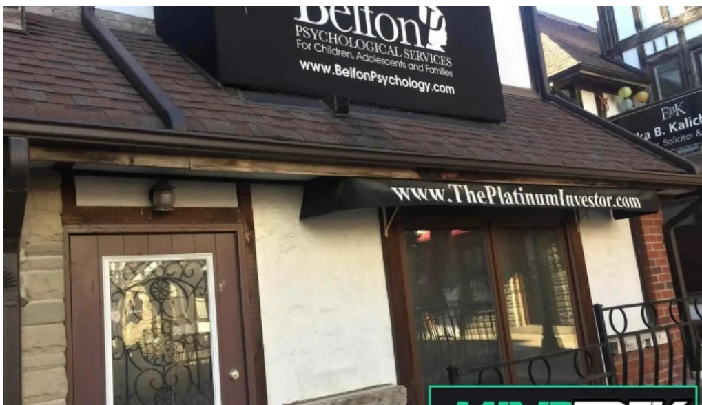
Belfon psychology all