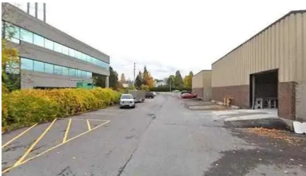
Waystone psychology street view 360deg