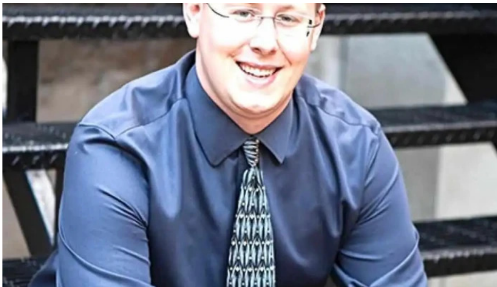
Waystone psychology by owner