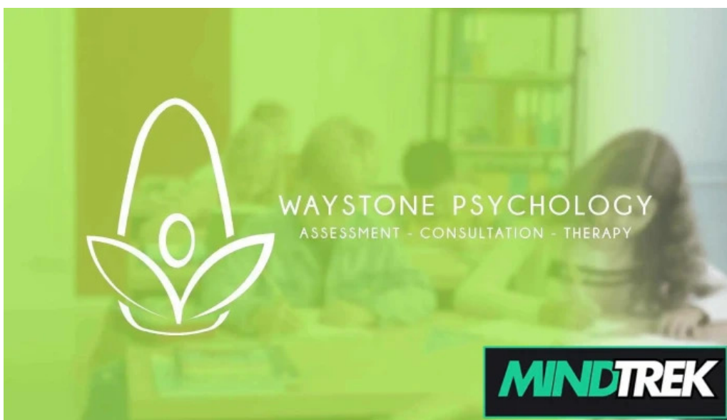
Waystone psychology ottawa