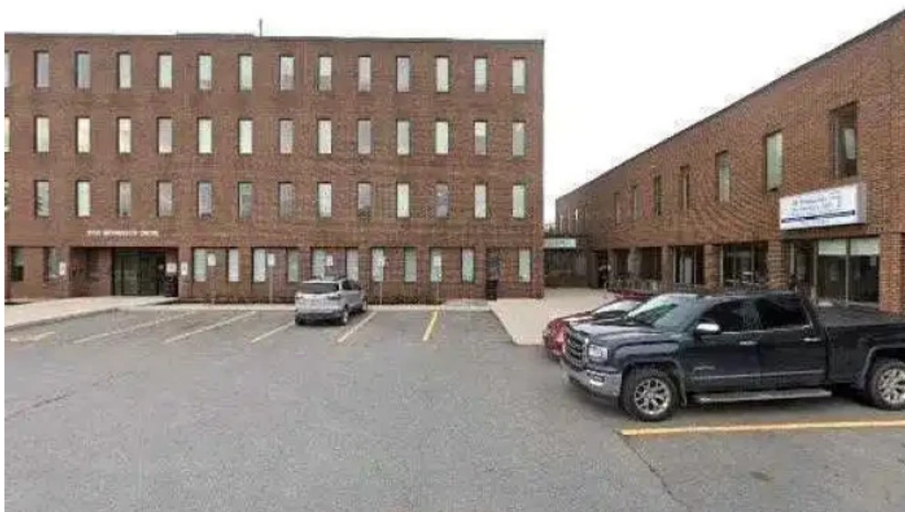
Centre for cognitive therapy street view 360deg