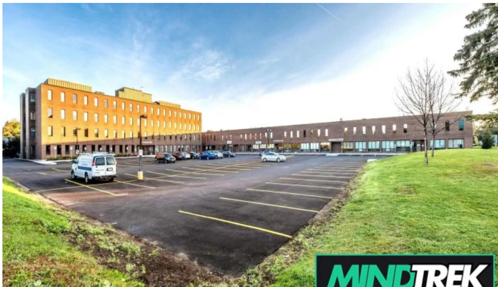
Centre for cognitive therapy building