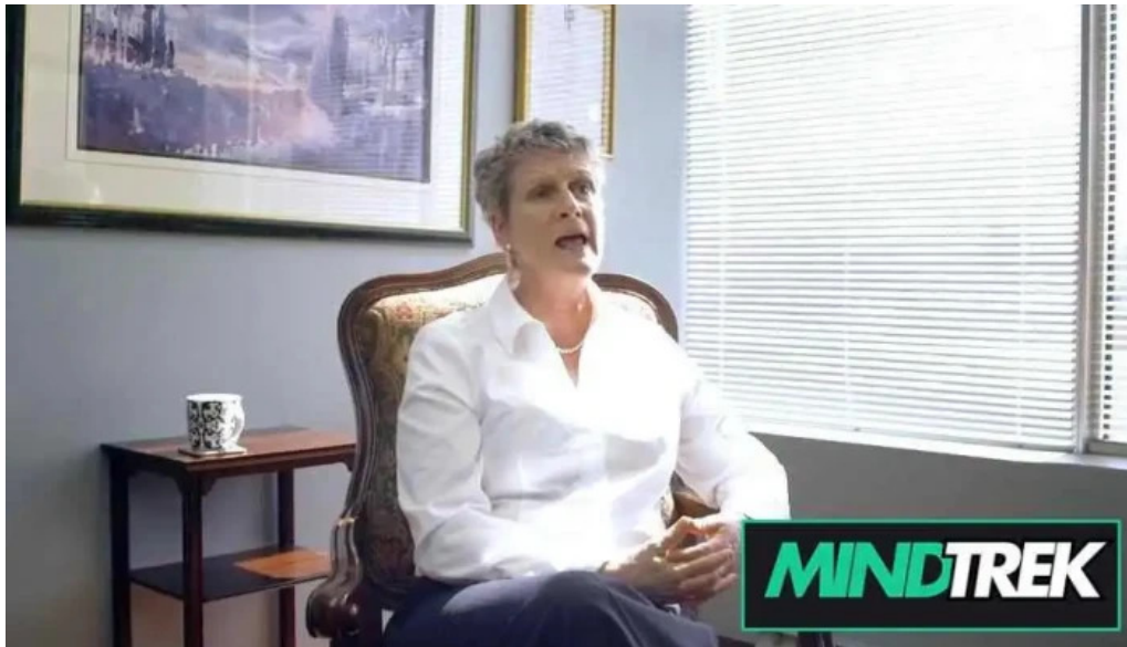
Centre for cognitive therapy videos