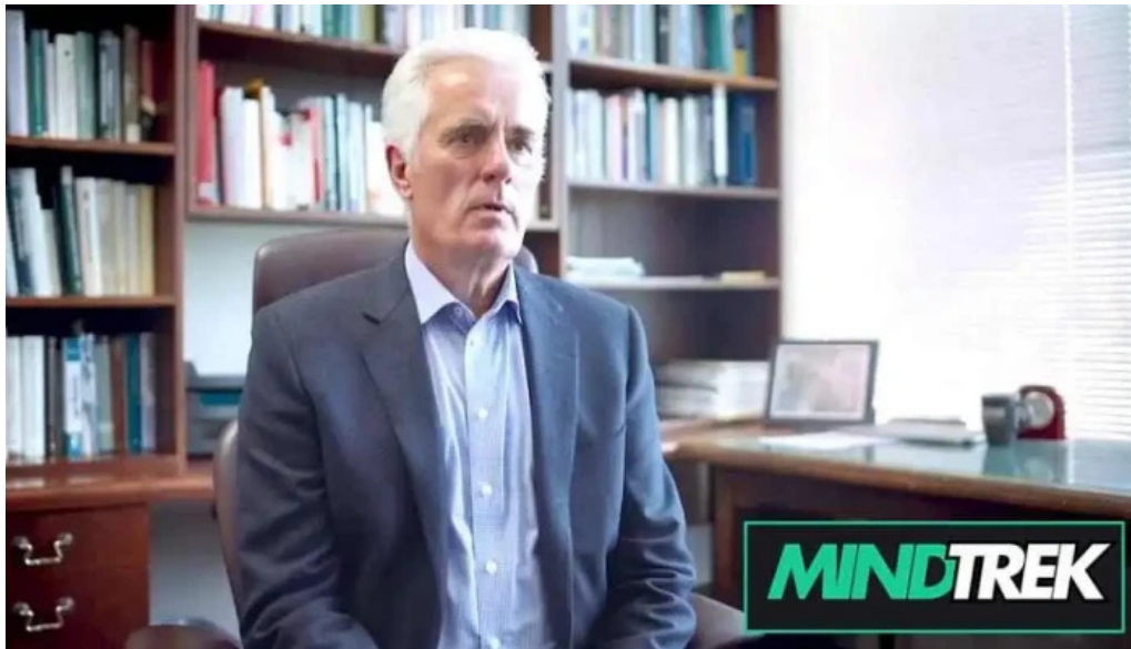
Centre for cognitive therapy by owner