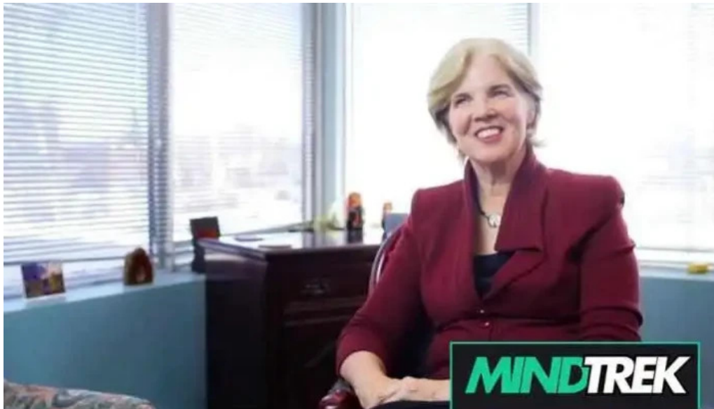
Centre for cognitive therapy ottawa