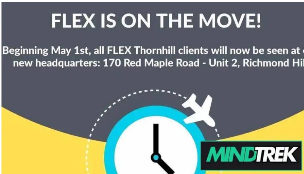
Flex psychology by owner