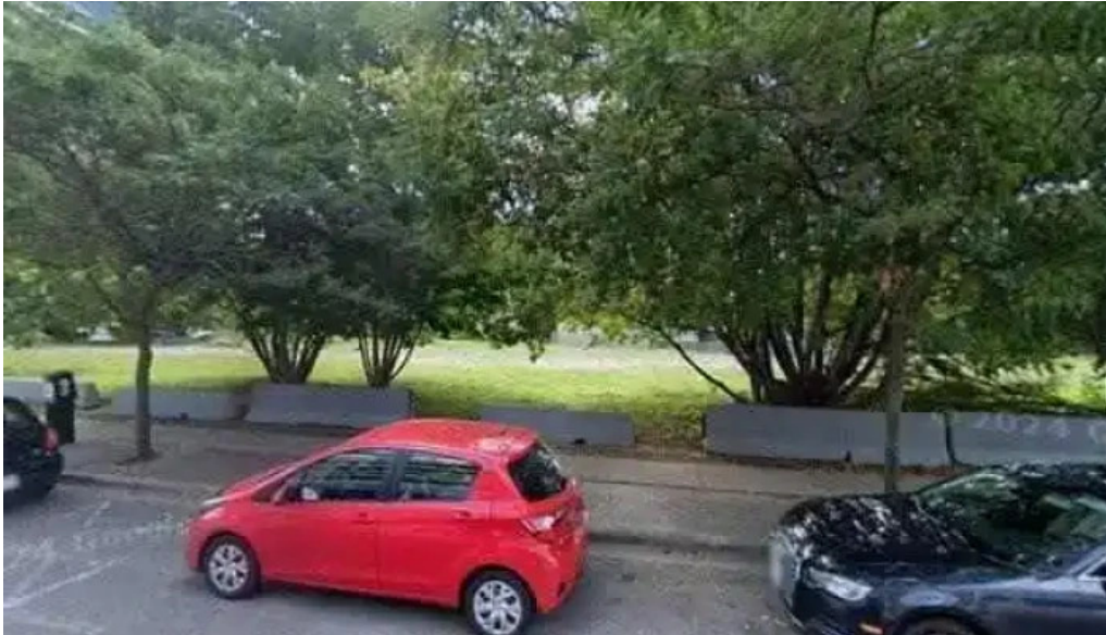
Flex psychology all