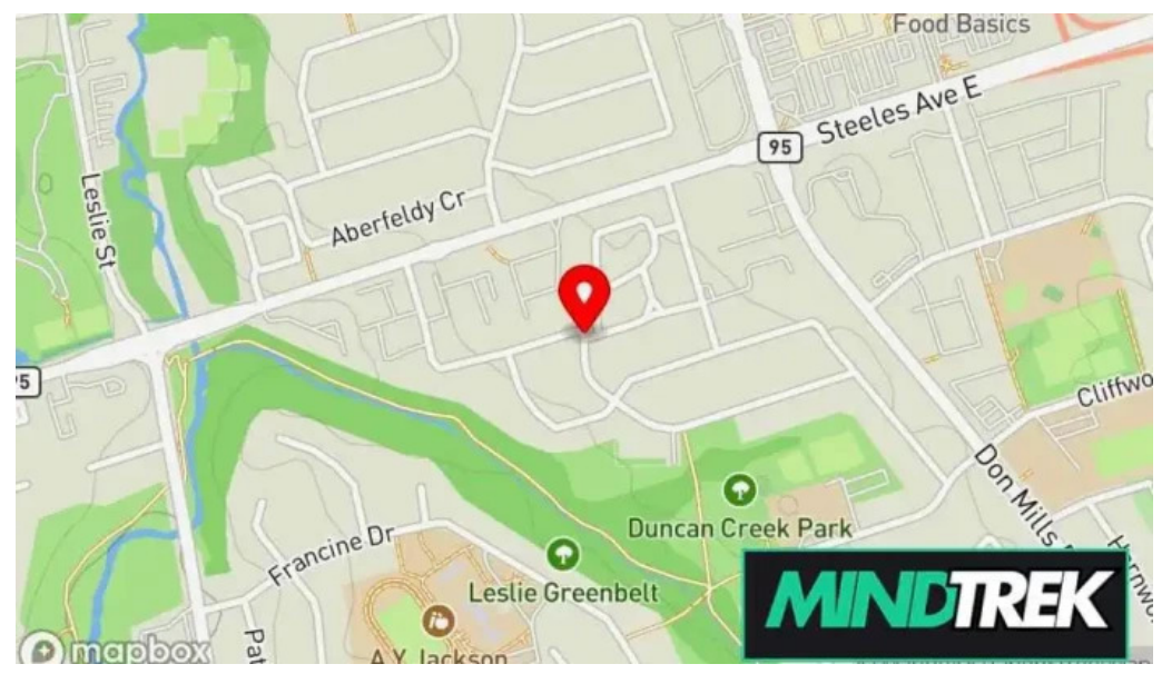
Psychology works map