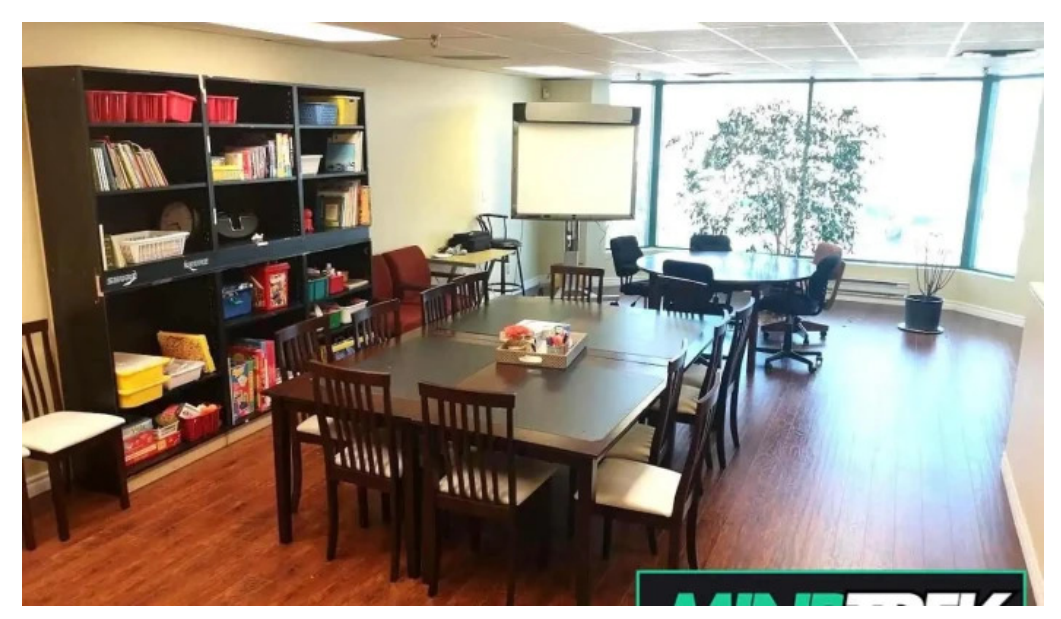
Psychology works ontario