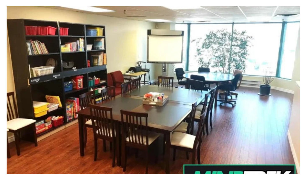
Psychology works all