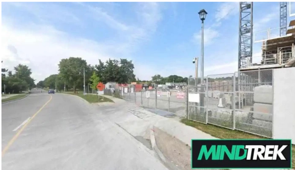
Jim salmon psychological services newmarket