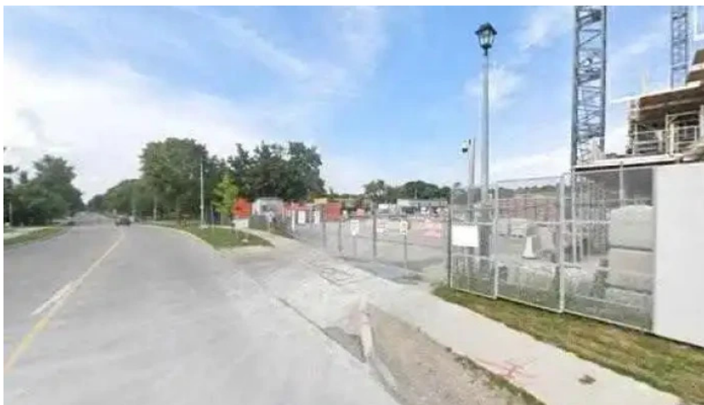
Jim salmon psychological services all