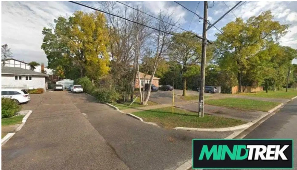
Claire rooney newmarket