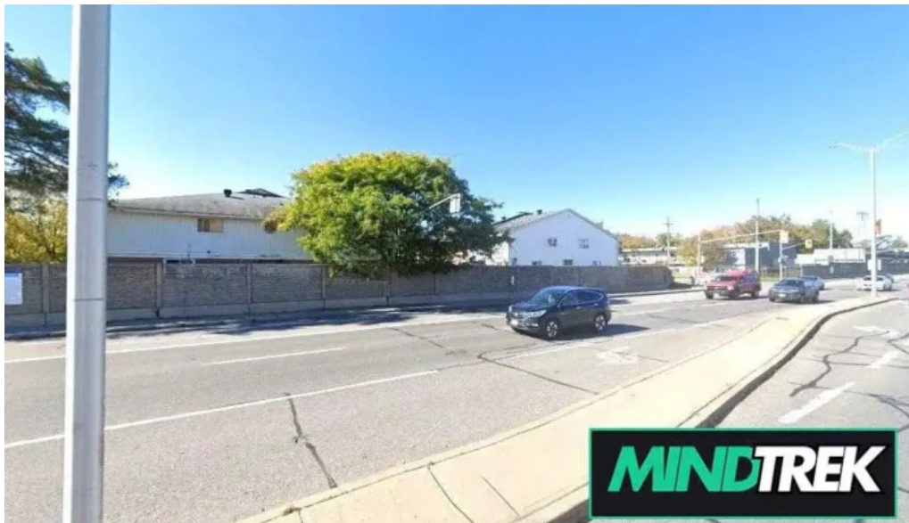
Thrive cognitive therapy nepean