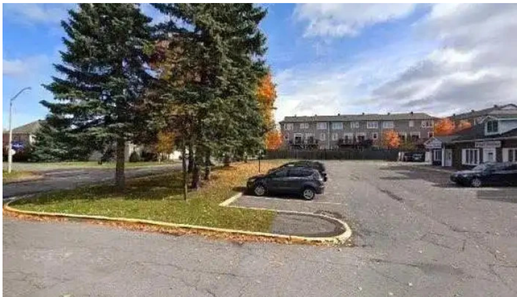
Ottawa west professional services all