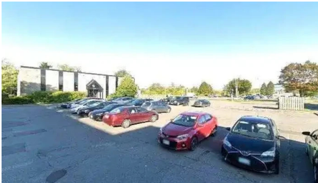
Ottawa west professional services all