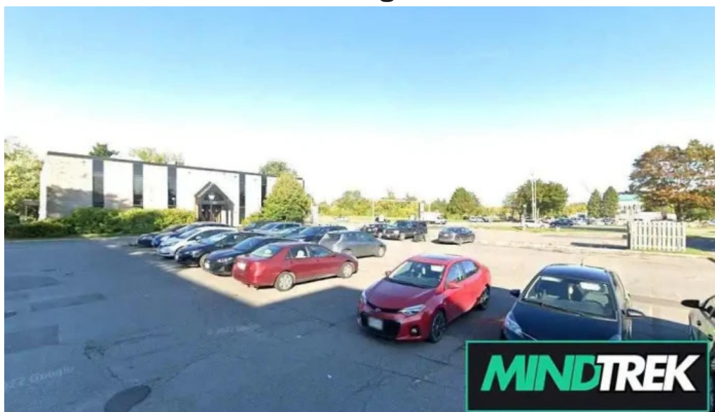
Ottawa west professional services nepean