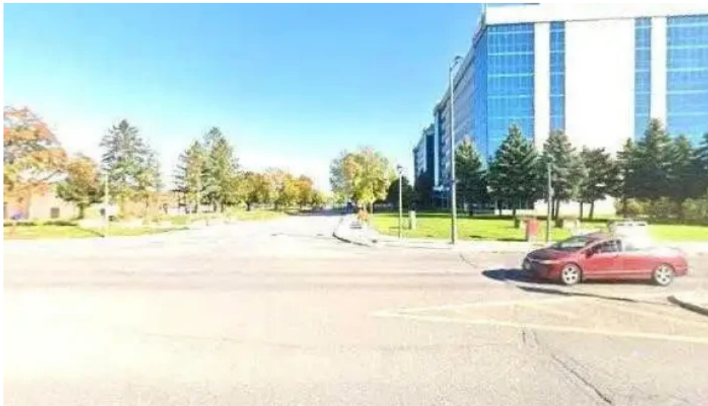
Ottawa psychology services all