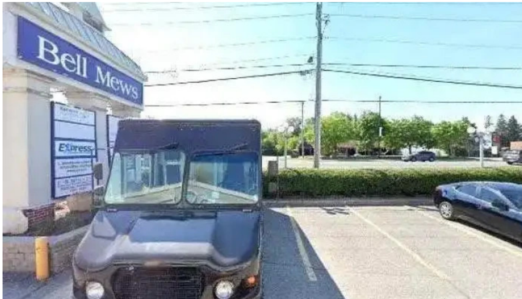
Nepean psychological svc all