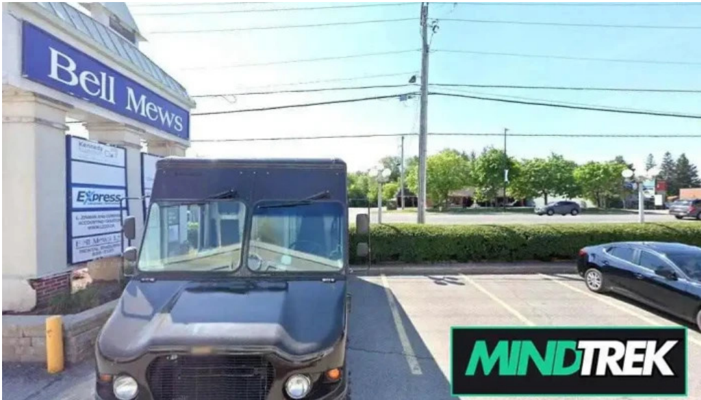
Nepean psychological svc nepean