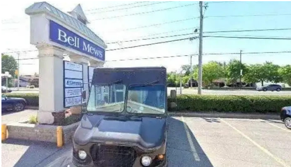
Mcgugan cognitive therapy all