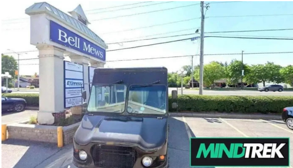
Mcgugan cognitive therapy nepean