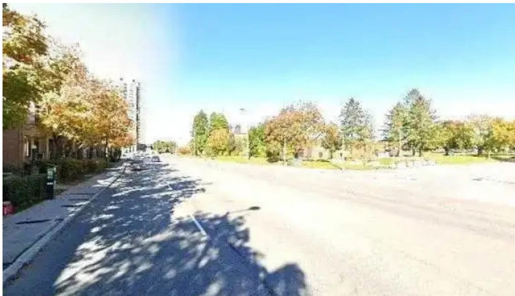
CentrepoinTE professional service all