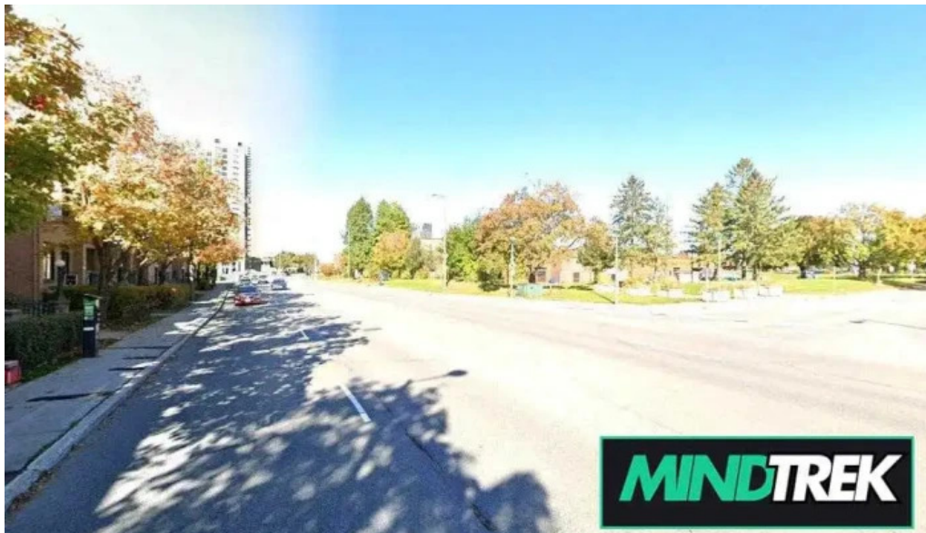
Centrepointe professional service nepean