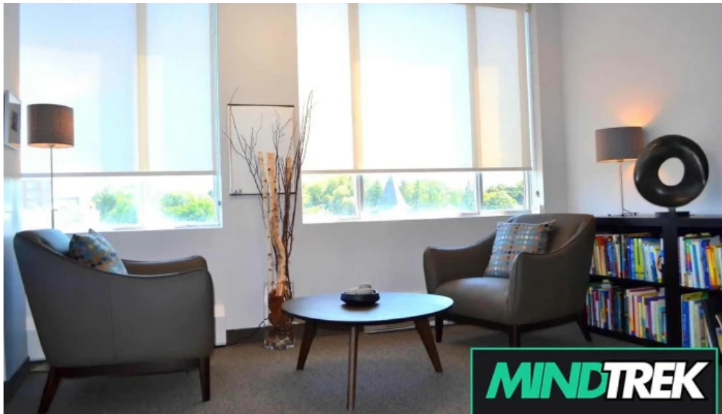
Centre for change all