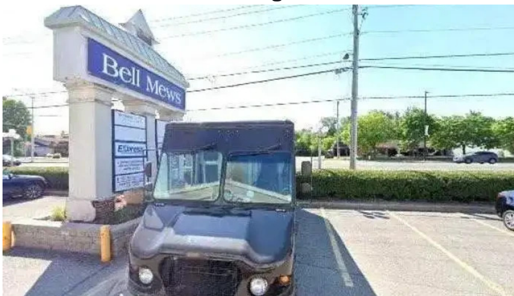
Centre for change street view 360deg