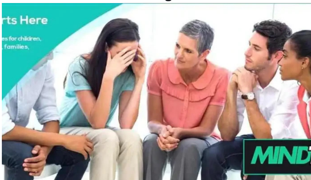
Vaughan psychologists maple