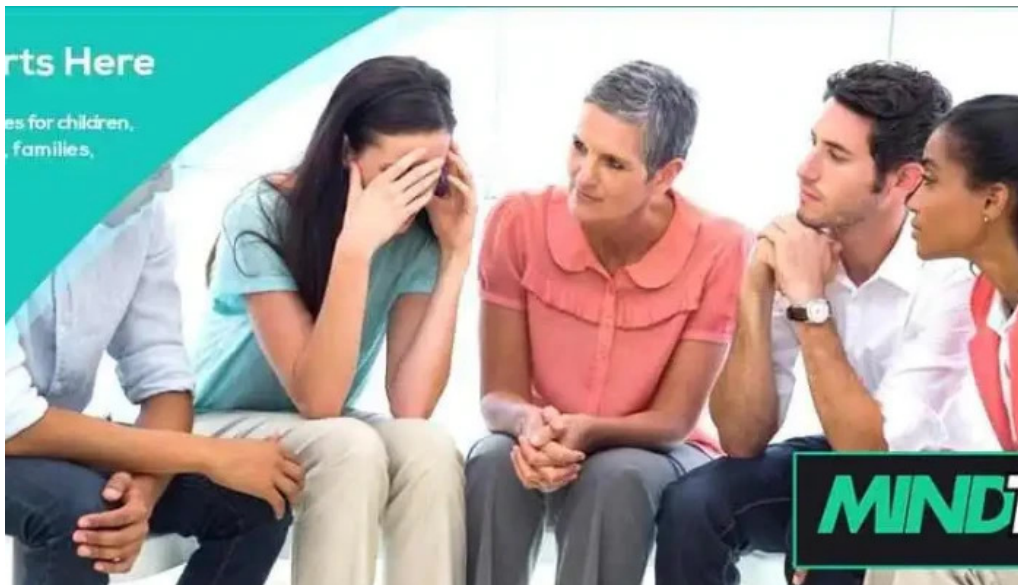
Vaughan psychologists all