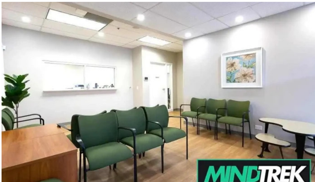
Hamilton psychological services by owner