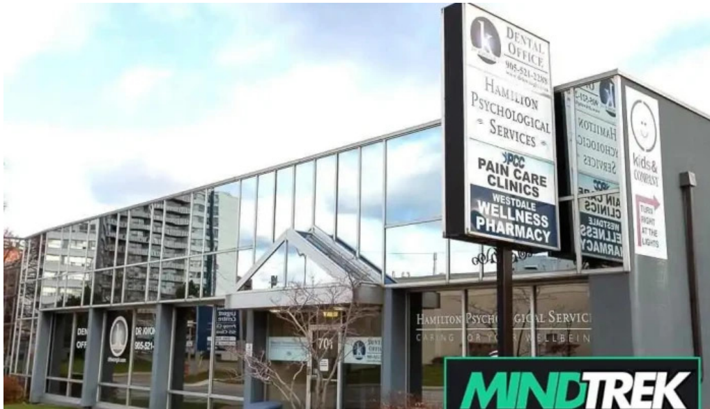
Hamilton psychological services all