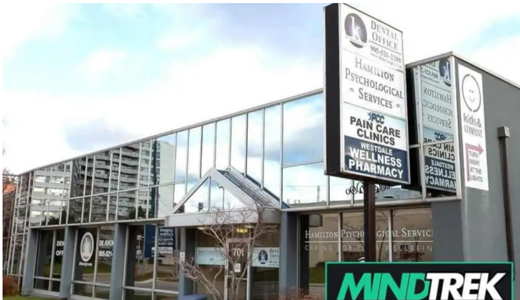
Hamilton psychological services hamilton