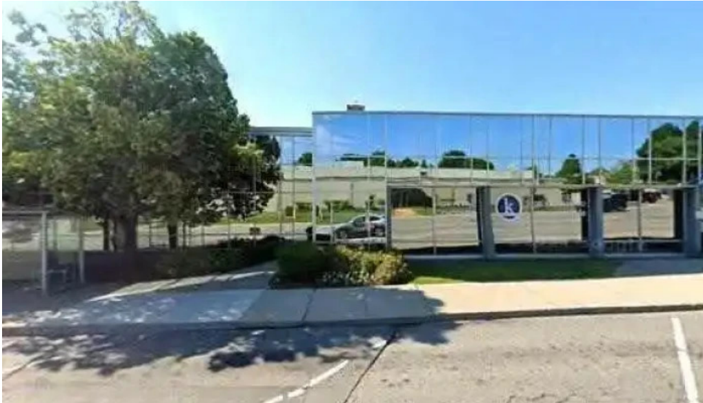
Hamilton psychological services street view 360deg