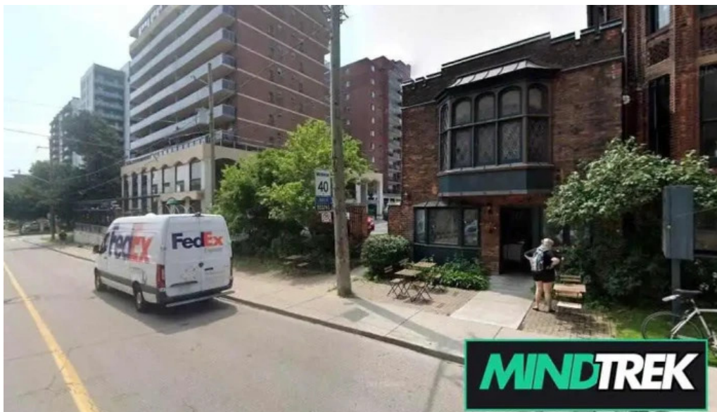
Dunn triano assoc hamilton