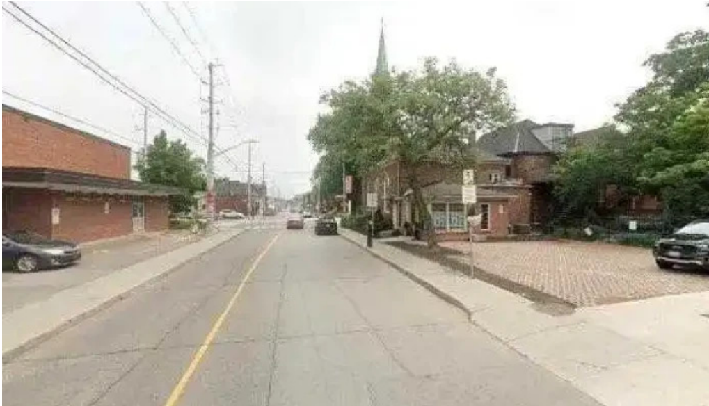
Dalton associates all