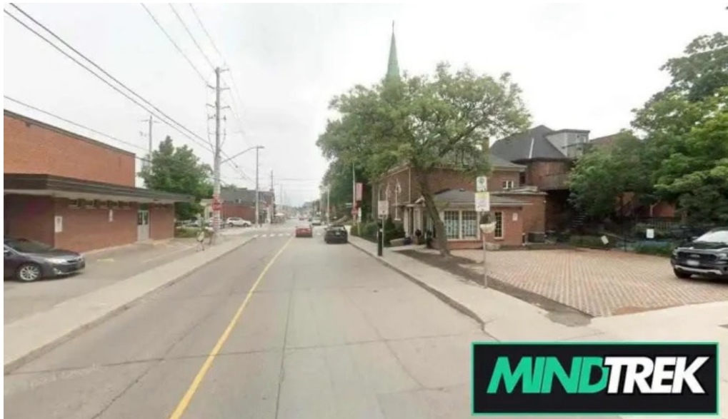
Dalton associates hamilton