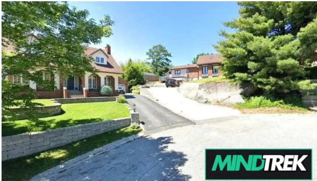
Laverdiere associates psychological services greater sudbury