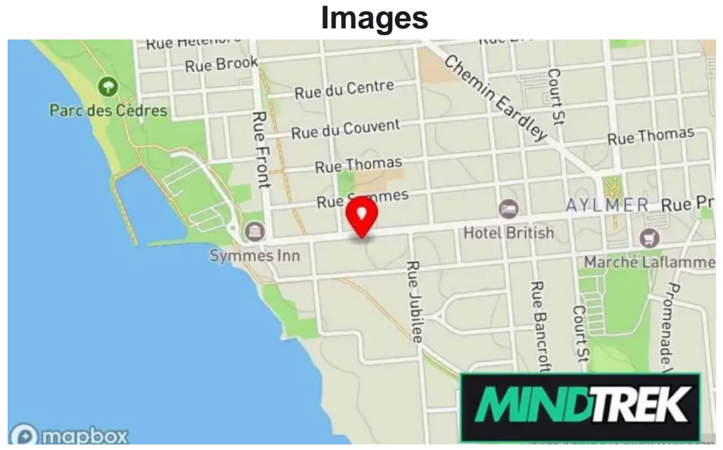
Masse monique psychologue map