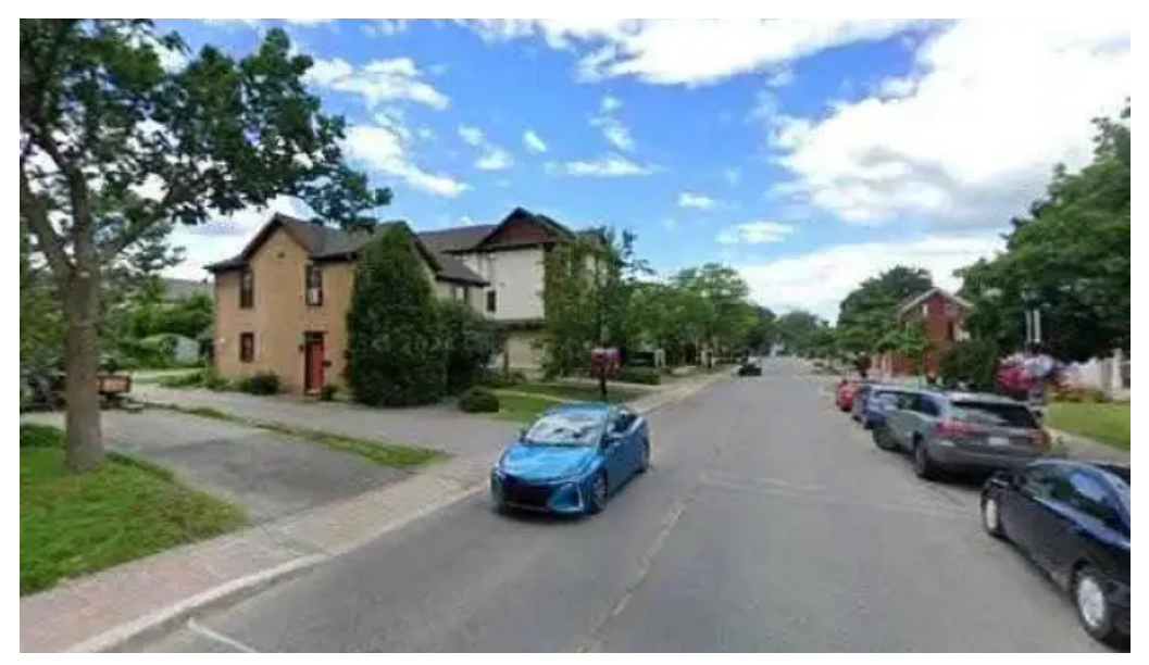
Masse monique psychologue all