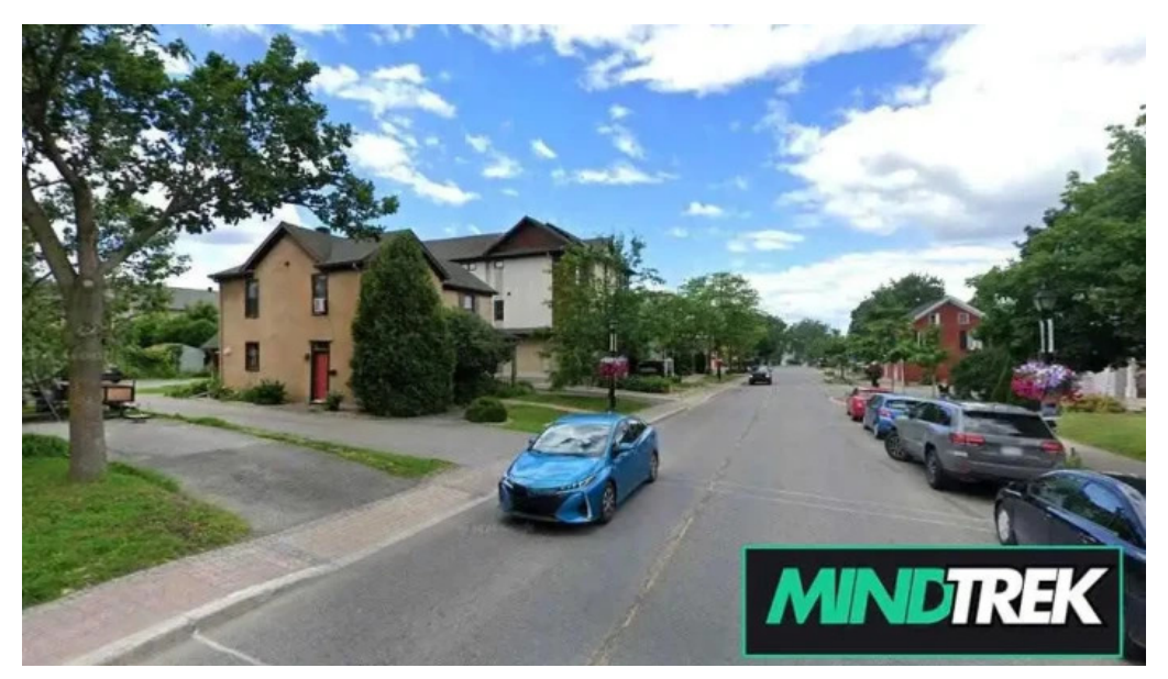
Masse monique psychologue gatineau