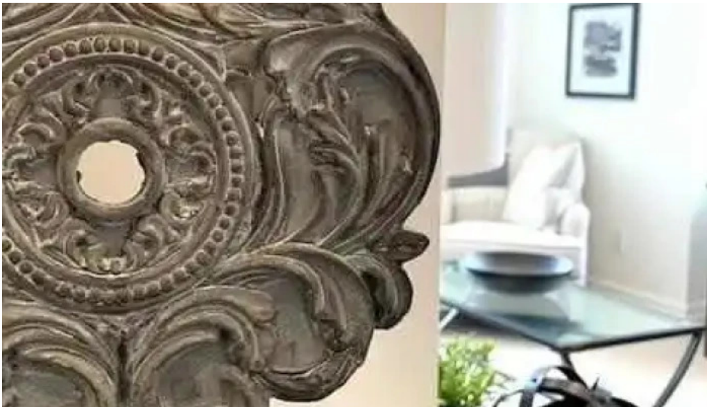
Cathy nagy psychology brooklin whitby brooklin