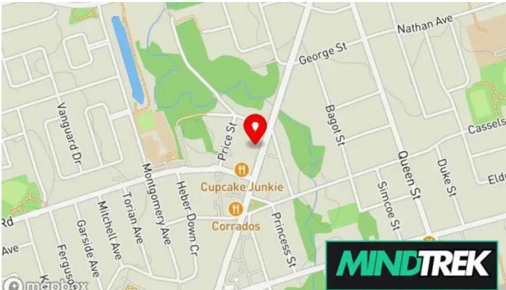
Cathy nagy psychology brooklin whitby map