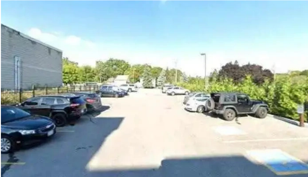
Cathy nagy psychology brooklin whitby street view 360deg