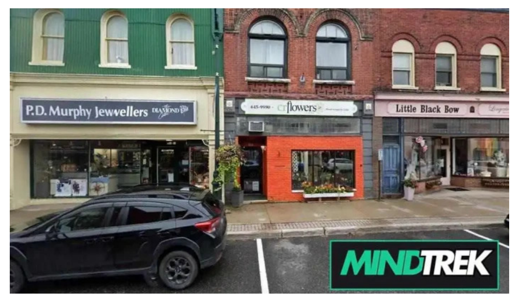
Private counseling associates bracebridge