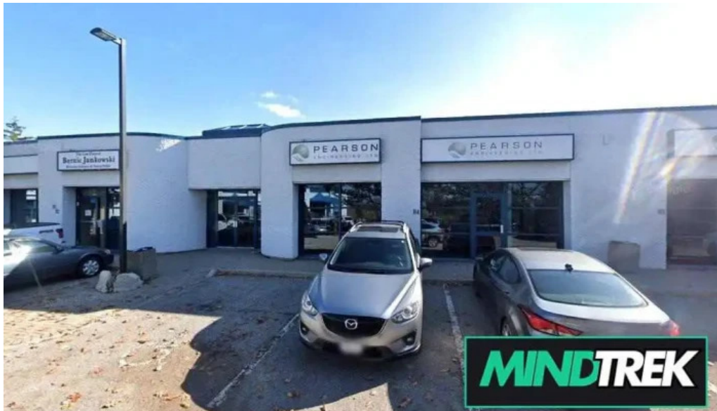
Dalton associates barrie