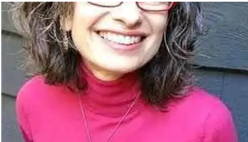
Dalton associates by owner