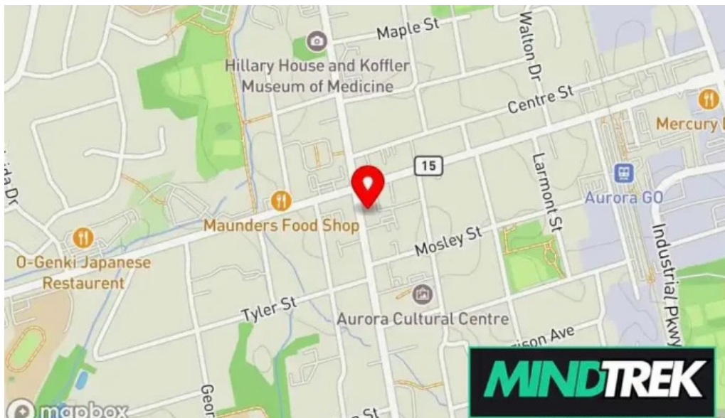
Samantha mcgrath map