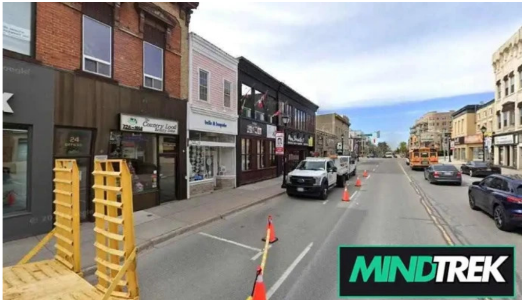
Samantha mcgrath aurora