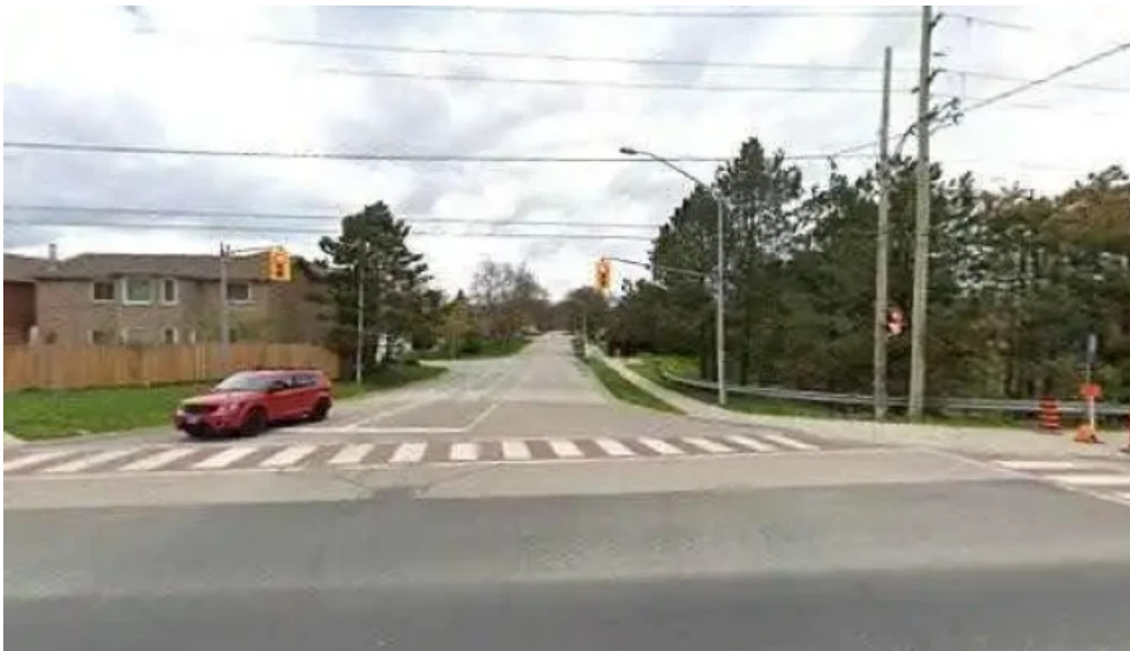
Dr joyce weinberg phd c psych street view 360deg