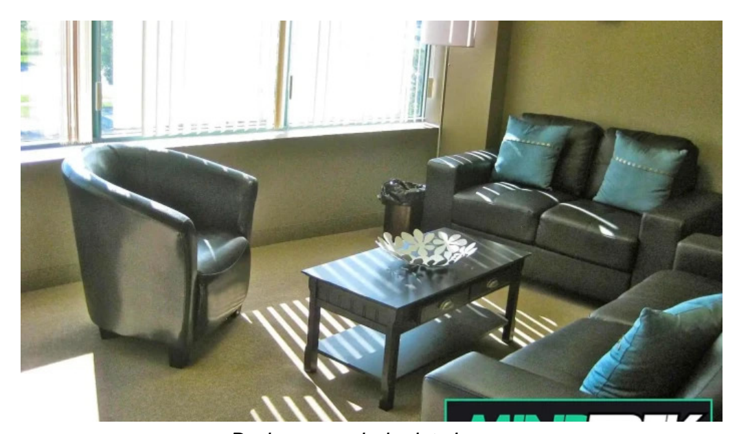
Durham psychologists by owner