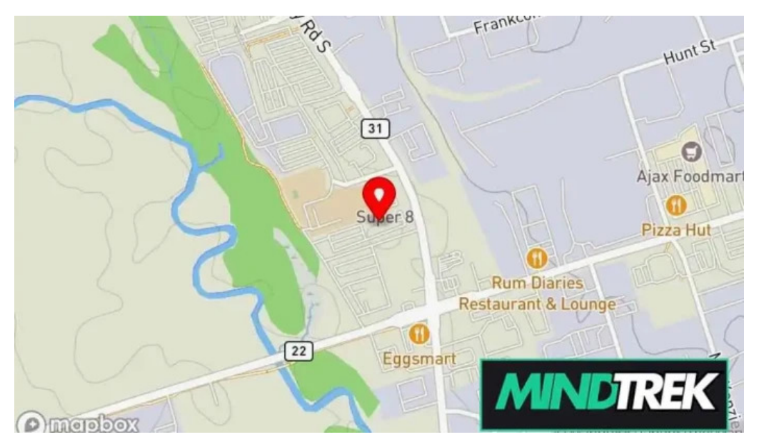
Durham psychologists map