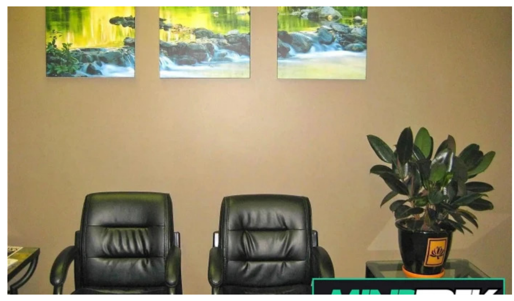
Durham psychologists all