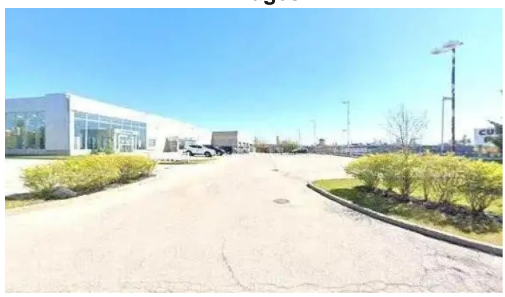
Durham psychologists street view 360deg