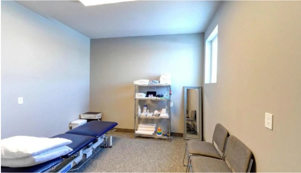
Lake country physiotherapy street view 360deg