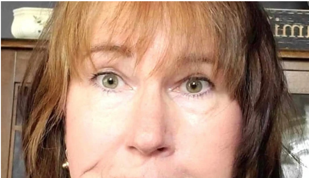
Lake country physiotherapy physical therapy clinic