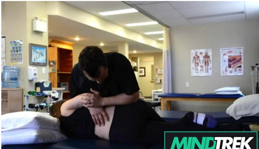
Lake country physiotherapy by owner