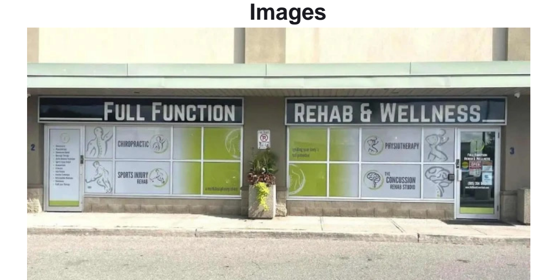
Full function rehab wellness woodbridge

In case you want to update any element that you feel is incorrect regarding this portal, please deliver a message and we will handle it as soon as possible. In advance we appreciate it.