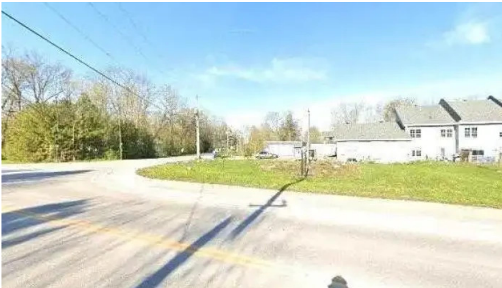
Junction rehabilitation physiotherapy chiropractor acupuncture and massage all registered street view 360deg