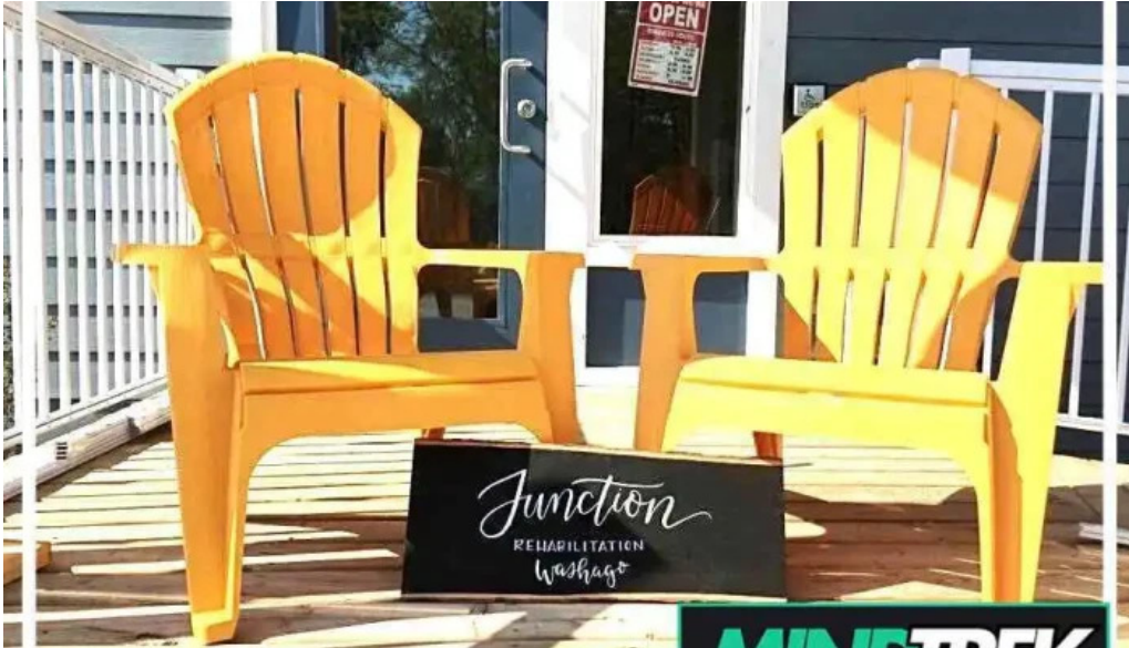
Junction rehabilitation physiotherapy chiropractor acupuncture and massage all registered ramara