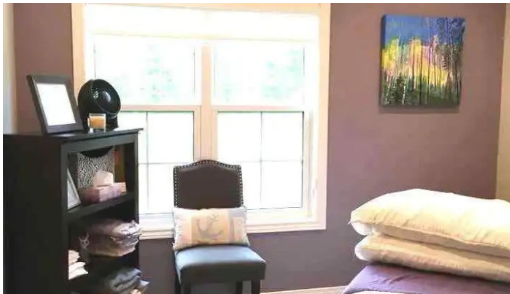
Junction rehabilitation physiotherapy chiropractor acupuncture and massage all registered by owner