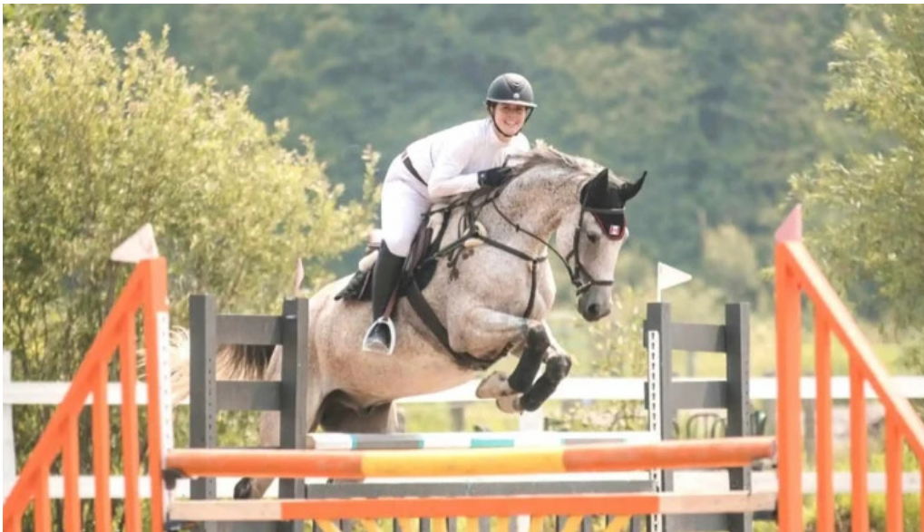
Mariposa physiotherapy rehabilitation physical therapist