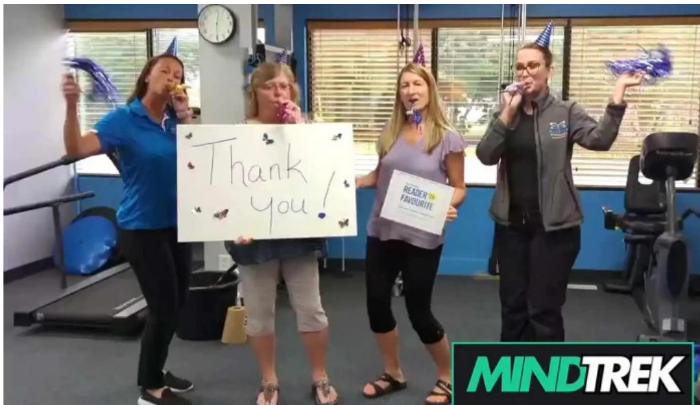
Mariposa physiotherapy rehabilitation videos