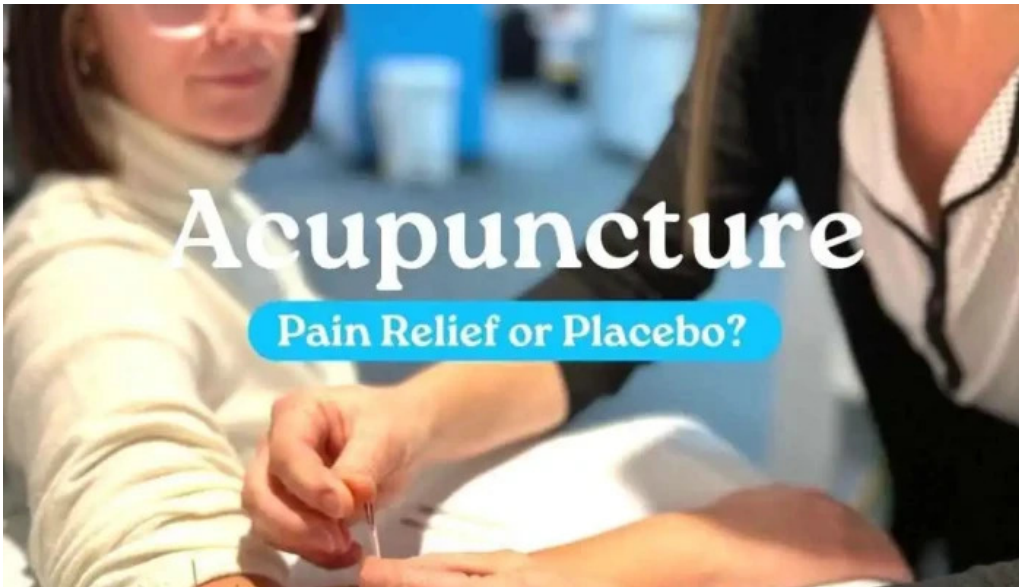
Mariposa physiotherapy rehabilitation by owner