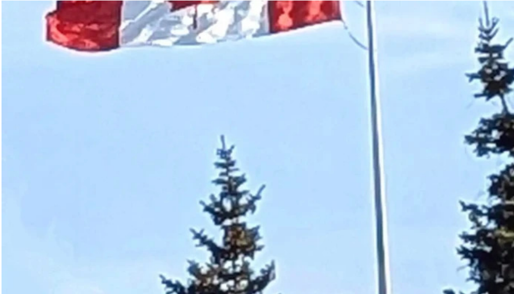
Mariposa physiotherapy rehabilitation latest