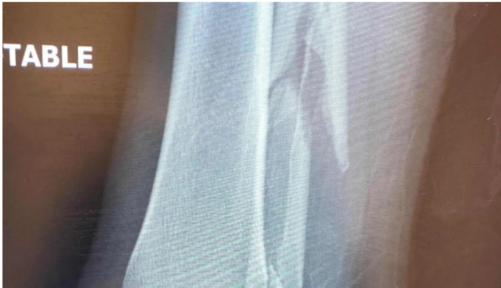
Mariposa physiotherapy rehabilitation website