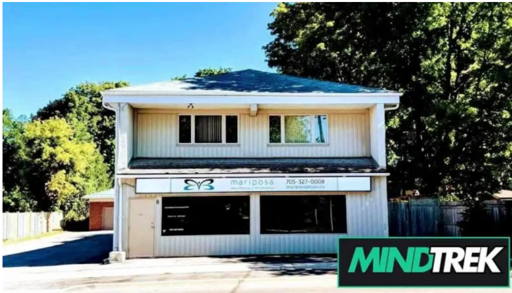
Mariposa physiotherapy rehabilitation all