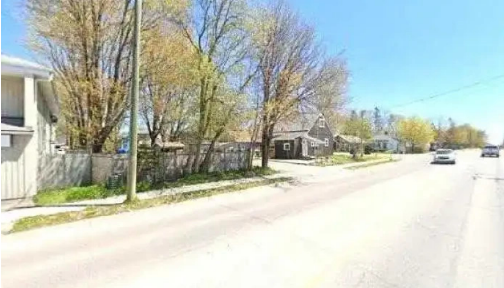
Mariposa physiotherapy rehabilitation street view 360deg