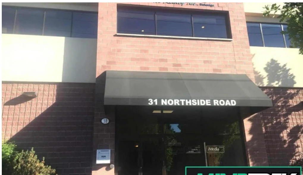
Neurologic physiotherapy the centre for myofascial release by owner