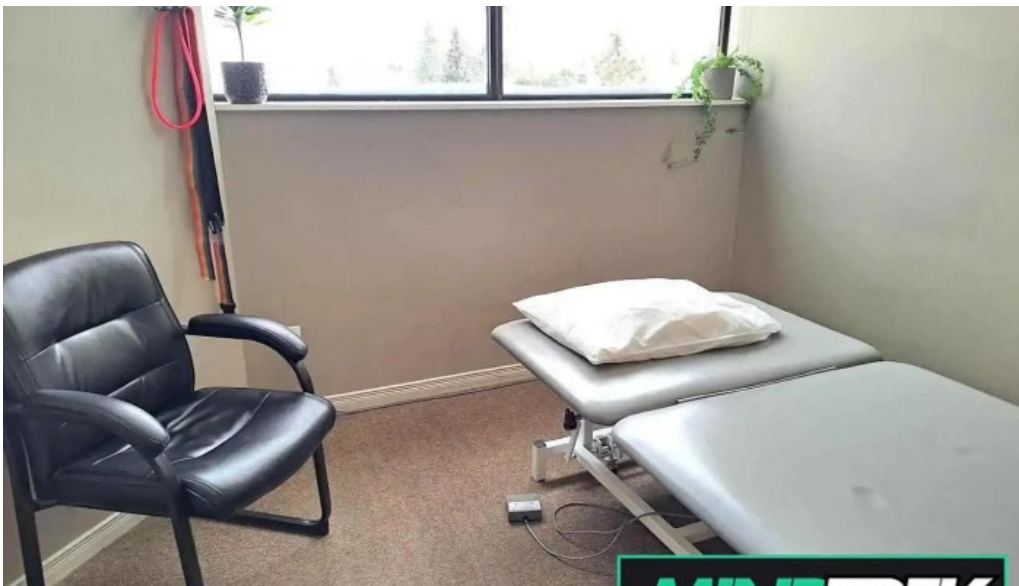
Neurologic physiotherapy the centre for myofascial release nepean