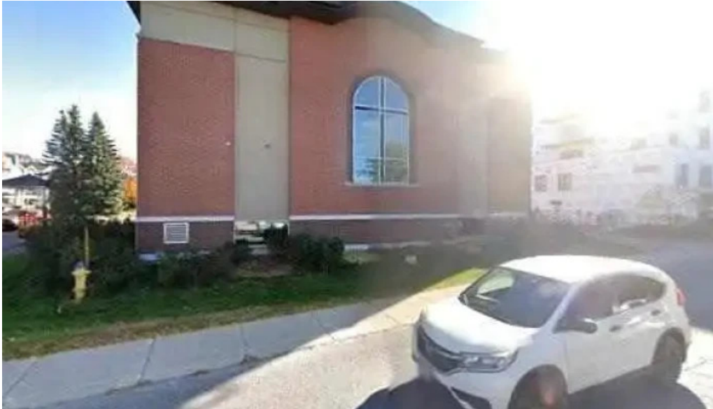
Neurologic physiotherapy the centre for myofascial release street view 360deg